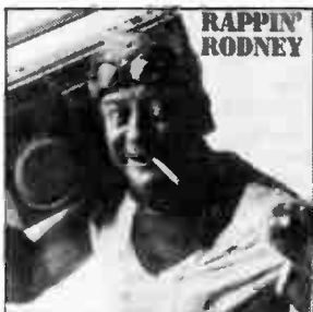
Rodney Dangerfield Featuring "Rappin' Rodney"