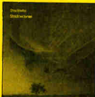
Shadowdance Windham Hill