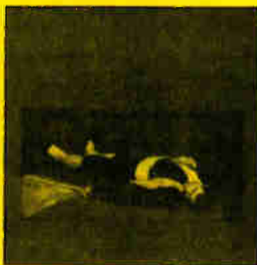
Love Is The Law Mercury