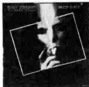
David Bowie Features: "White Light, White Heat" plus many Bowie classics