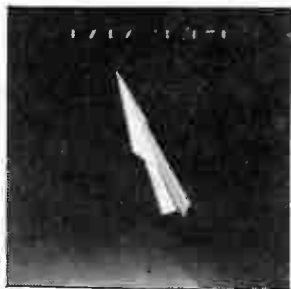
Parachute Club Features: "Rise Up" "Alienation"

Be sure to check out these new RCA smashes: