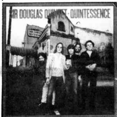
Sir Douglas Quintet