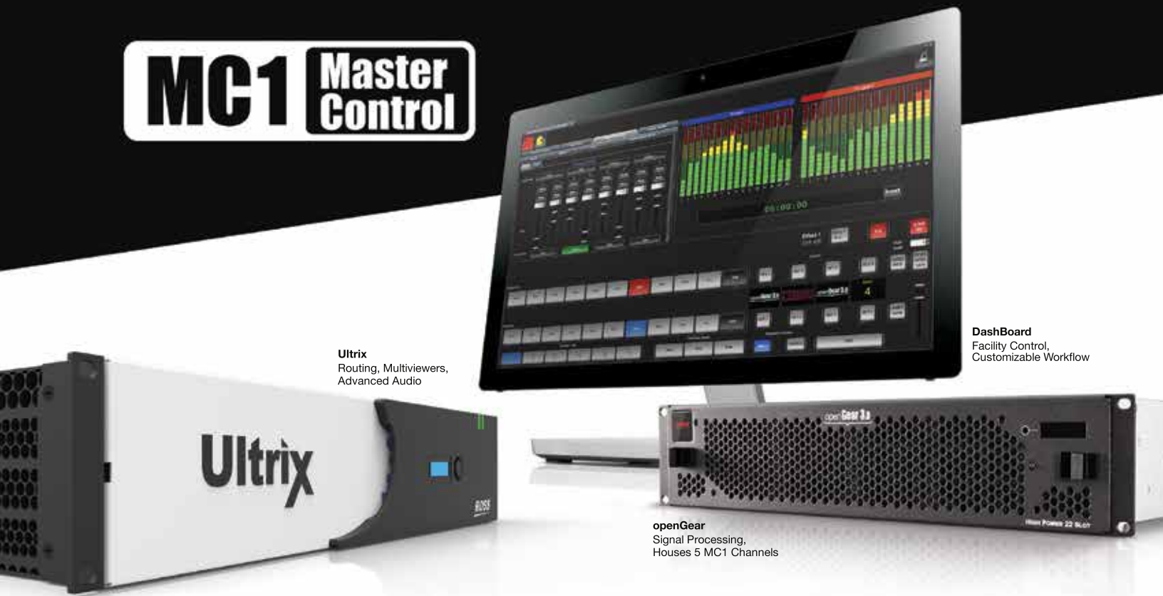
Ultrix Routing, Multiviewers, Advanced Audio