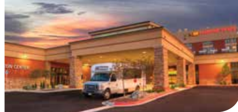
The Crowne Plaza DIA

AVX registration can be made through the AVX show website. The expo and