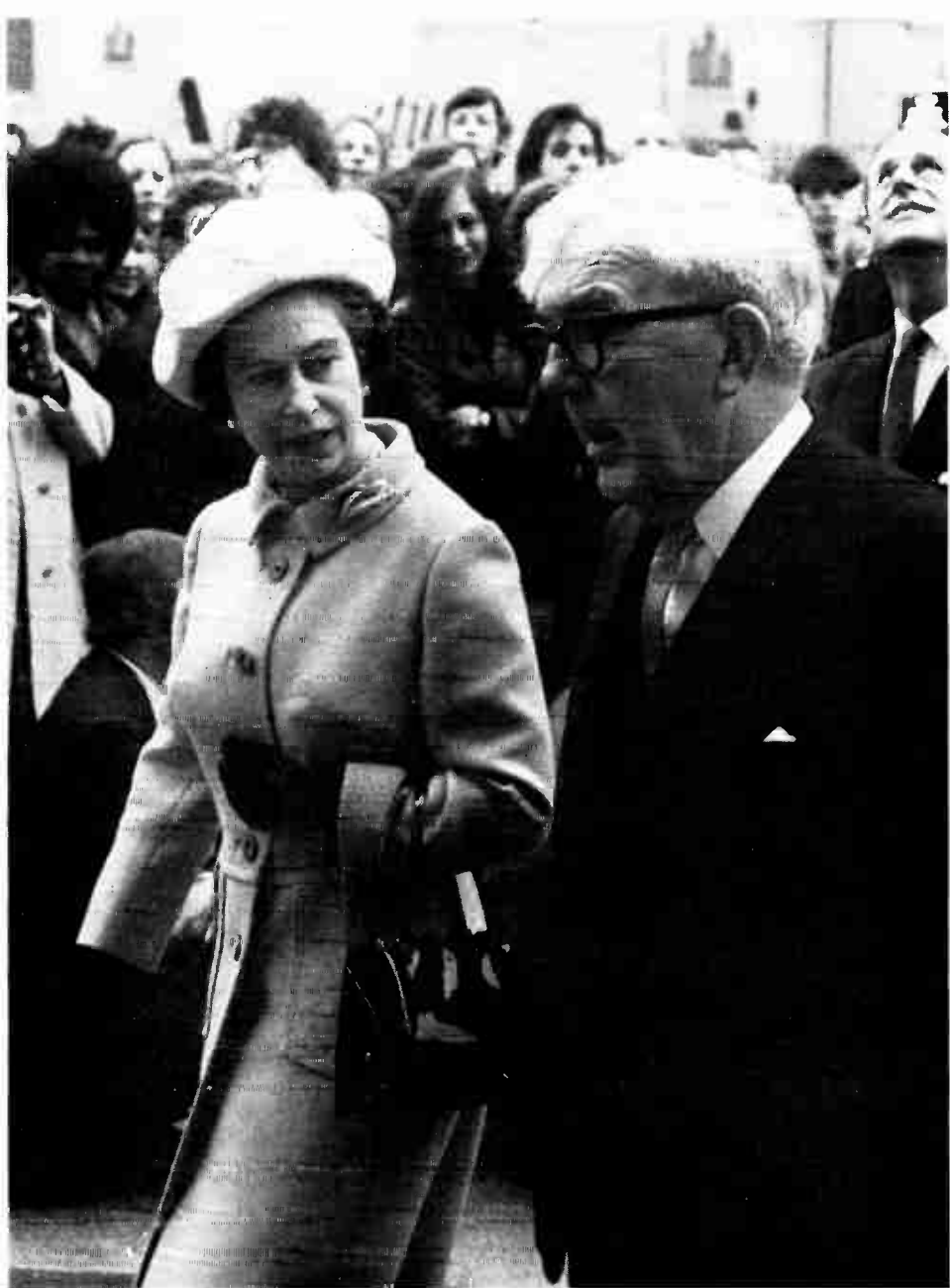
H.M. the Queen with Lord Hill at the opening of the BBC's fiftieth anniversary exhibition.