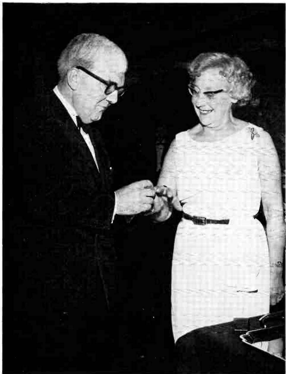
The author placing a ring on Lady Hill's finger. The ring was part of the presentation made in 1963 by the people of Luton following Lord Hill's retirement from the House of Commons.