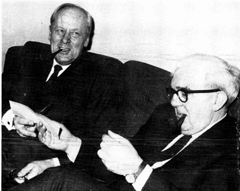
Professor Sir Michael Swann with Lord Hill whom he succeeded as chairman of the BBC in January 1973.