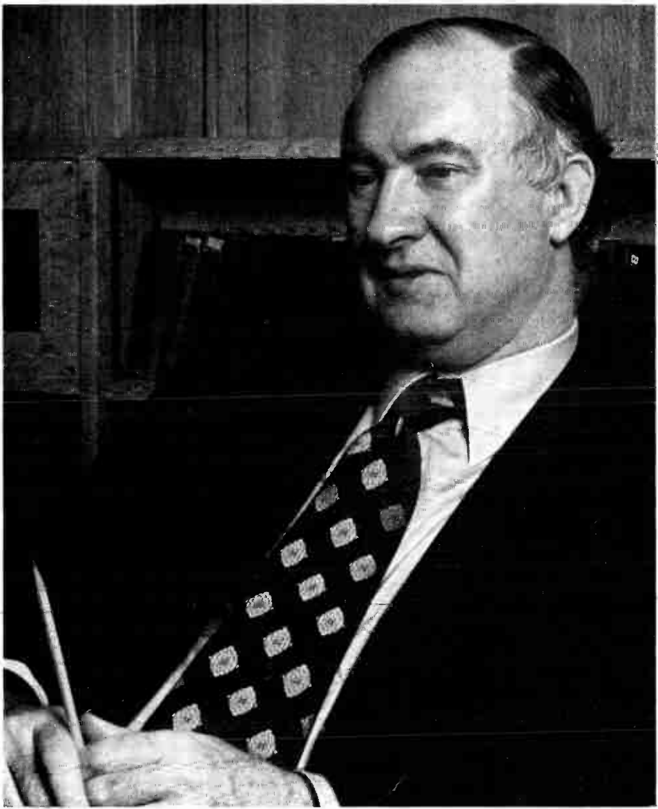
Sir Charles Curran, director-general of the BBC since Sir Hugh Greene's retirement.