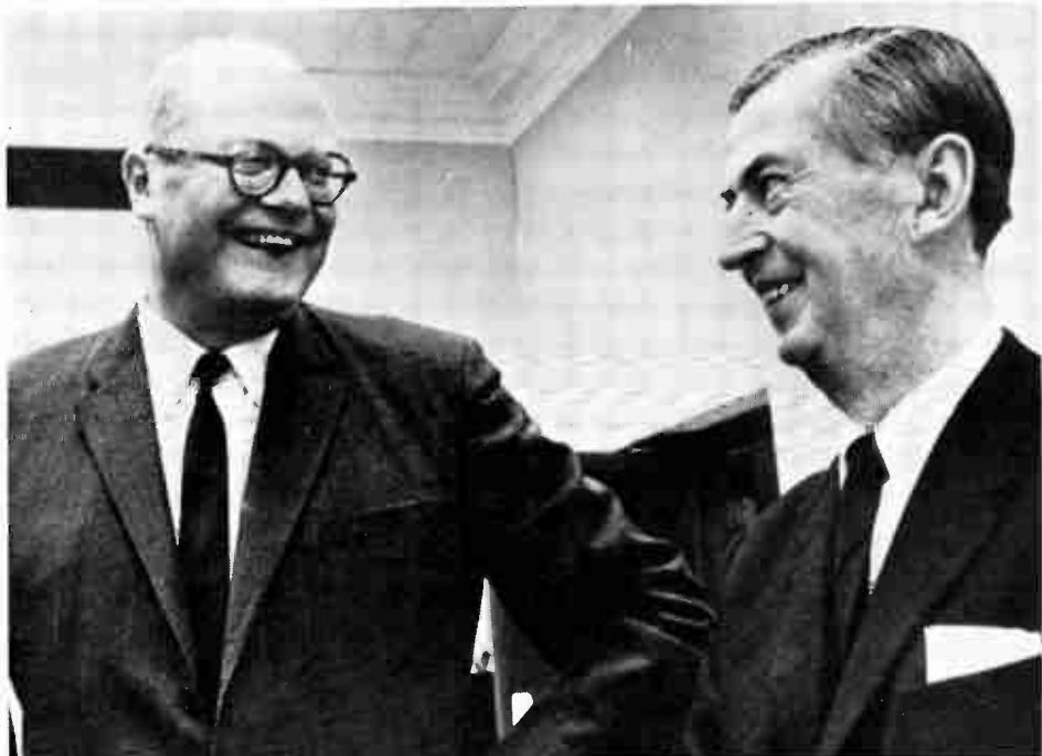
Sir Hugh Greene (left), director-general of the BBC until his retirement from that post in March 1969 with Sir Robert Fraser, director-general of the ITA until October 1970.

Frank Gillard and Lord Hill at the news conference held on 10 July 1969 to announce the BBC's plan for network radio and non-metropolitan broadcasting.