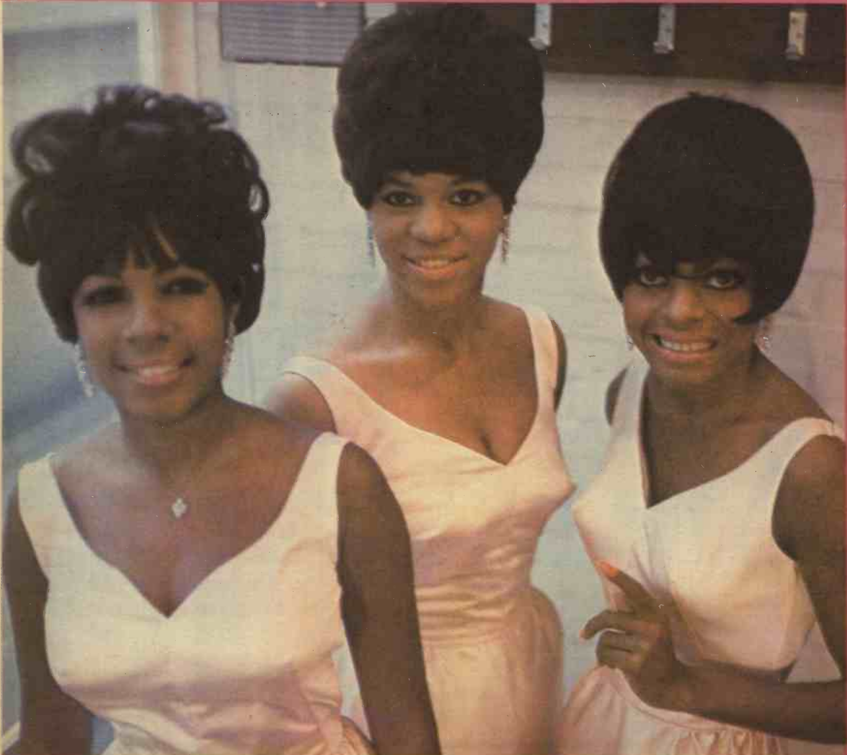
MICKIE DOLENZ