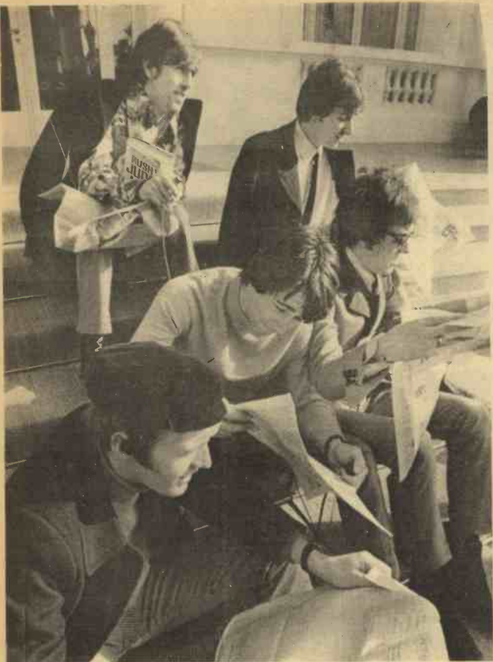
THE HOLLIES talk about writing songs