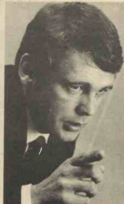
DUANE EDDY — seen during a press reception for him at Pye records

"I don't play my old tracks too often — but every once in a while I do. I haven't any regrets about any of the records I've made, except perhaps the "Dylan" album. I didn't do that one the way I wanted to. You know, I collaborate with