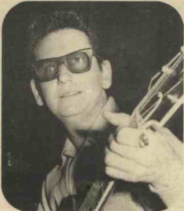
ROY ORBISON—talks about rock'n' roll days.

BELL MUSIC (Dept. 21) 157/9 Ewell Rd, Surbiton, Surrey. Callers welcome. Open all day Saturday.