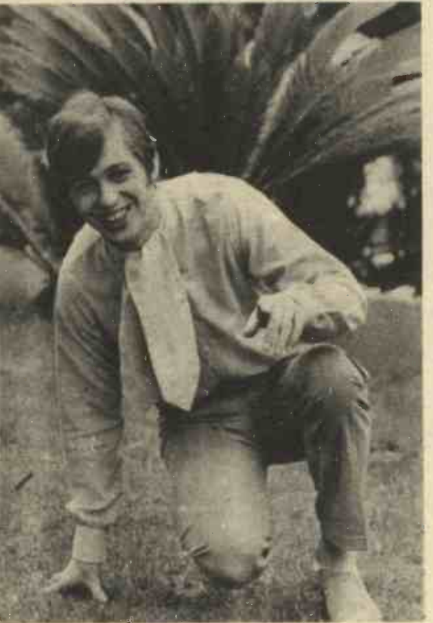
GEORGIE FAME — now he's changed labels EMI have taken the step of issuing his best sides on a very good album, reviewed here.