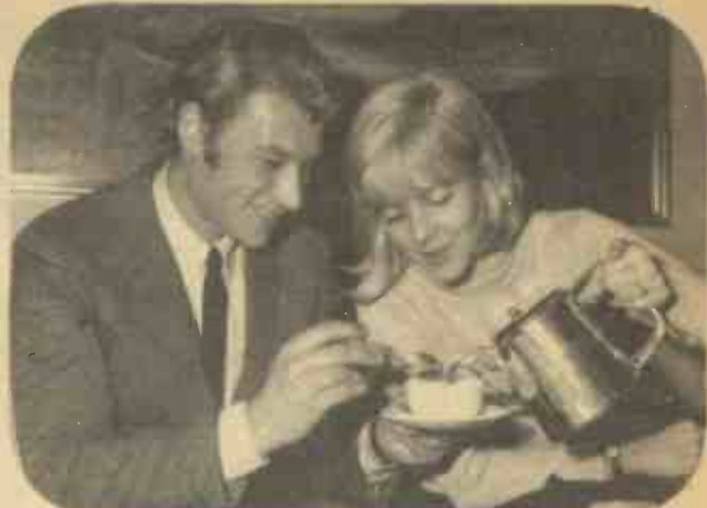
JOHNNY HALLYDAY with his wife, SYLVIE VARTAN