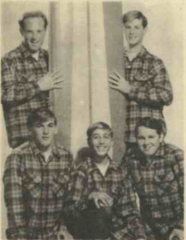
THE BEACH BOYS — don't they look different! This is their 1963 line-up which was (top, left to right) Mike Love and Brian Wilson, bottom, Dennis Wilson, an ex-Beach Boy whose name we don't know and Carl Wilson. Al Jardine, Bruce Johnson, weren't in the group then...