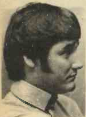
P. J. PROBY