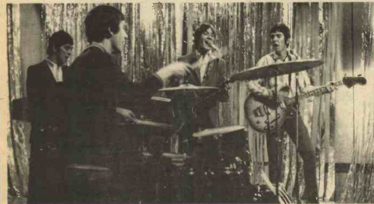
THE SMALL FACES—their longest-ever nationwide tour is just starting—38 days on the road.

our tapes to Decca. We now produce our records ourselves at Olympia Studios — and we've got two engineers working with us. There are further plans to tie-in with Immediate, but they're still under negotiation."