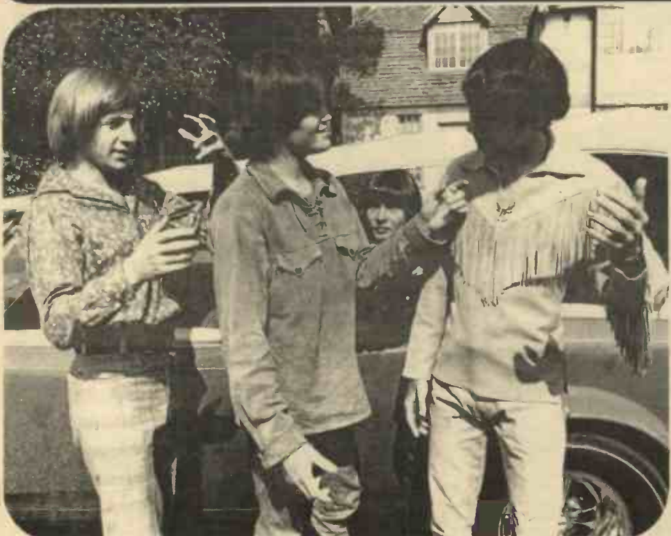
If you think the MONKEES are about to have a friendly fight—you're probably right. That's why Davy is staying in the Monkeemobile!