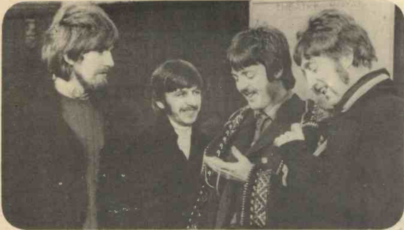
THE BEATLES — as they are today, different at least. This pic was taken during recent filming in Kent to promote "Penny Lane" and "Strawberry Fields Forever". Here they're seen playing about with their stop-watches.