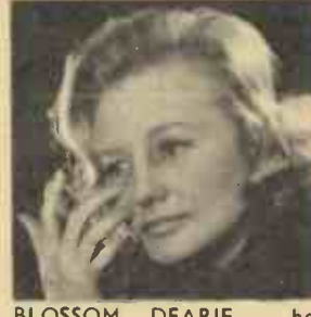
BLOSSOM DEARIE — her current pop (?) single is "Sweet Georgie Fame"

Although Blossom's home is basically in New York City she hates the town and intends to spend much more time in London. "New York people are so terrible. They fight to get taxis. And the taxi drivers lock you in in case anybody leaps in to kill you, I'm not exaggerating. I live in Greenwich Village and I