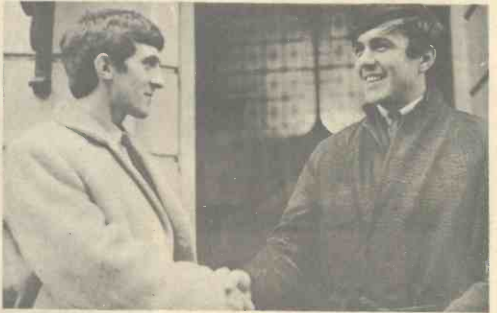
Dave Clark meets Ray Ennis of the Swinging Blue Jeans. Congratulations are exchanged by the leaders of the two hit groups.

Starting Friday week, Dave Clark and the boys return to the Royal Ballroom, Tottenham, in North London for a five or six week season. This is home territory for Dave, who still supports the local Hotspurs. You'll probably recall the uprisings among the fans when the group was engaged at Basildon, Essex—all the protest marches on the Royal Ballroom and the petitions