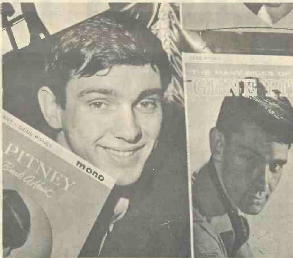
Gene Pitney surrounded by many of his L.P. sleeves. His latest disc "24 hours from Tulsa" is his biggest hit ever here.

"Well, we wrote it in about twenty-five minutes. It was one of two songs that we wrote that evening—and the session went very well indeed. But we hadn't any idea who would want to record it until we went to our studios to see Andrew Oldham. He played it to Gene who was rather interested, and he kept coming