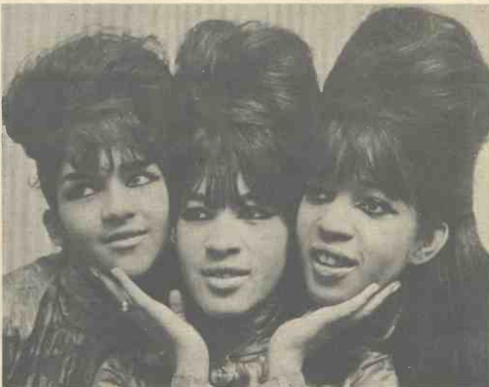
The very attractive Ronettes are in town prior to setting out on their first British tour. The story of their success is told alongside.

Tour dates, from today (Thursday): January 9, Granada Kettering; 10, Granada Walthamstow; 11, Plazas, Old Hill and Handsworth; 12, Granada Tooting; 14, Granada Mansfield; 15, Granada Bedford; 17, Ritz Nuneaton; 18, Winter Gardens, Malvern; 19, Coventry Theatre, Coventry; 20, Granada Woolwich; 22, Granada Shrewsbury; 24, Scotland; 25, Scotland; 26, De Montford Hall, Leicester; 27, Colston Hall Bristol.