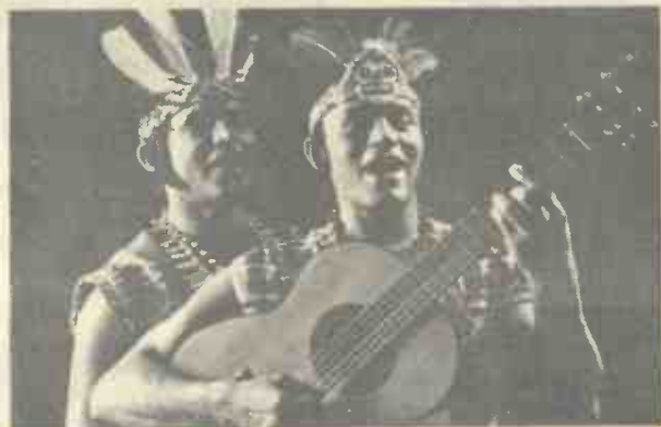
RCA 1365 45 rpm