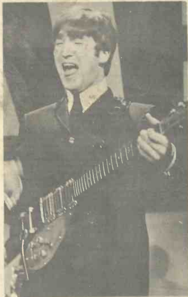
John Lennon—A handwriting analysis of the leader of the Beatles. And a very interesting result too.

Keep an eye open for the analysis of each of these "quarters" of the fantastic Beatles, in following editions of the Record Mirror.