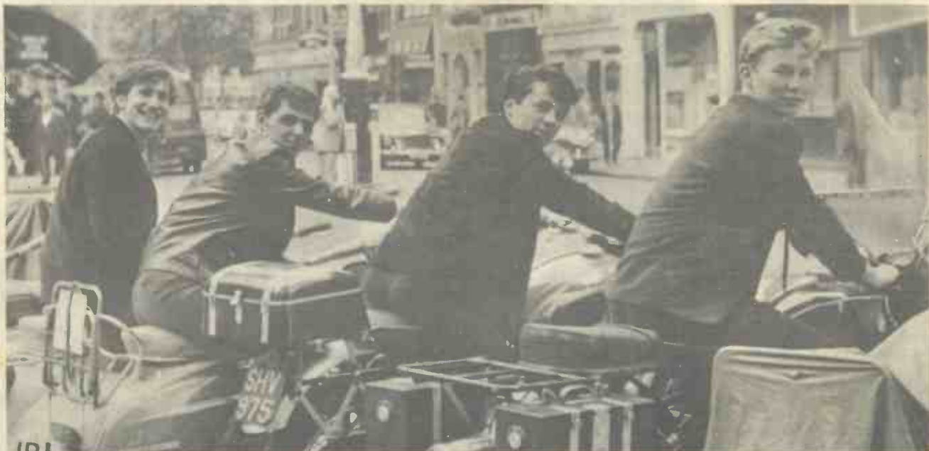
The Searchers all set up and a-rarin' to go. With their new disc "Needles and pins" which should go shooting up the charts.