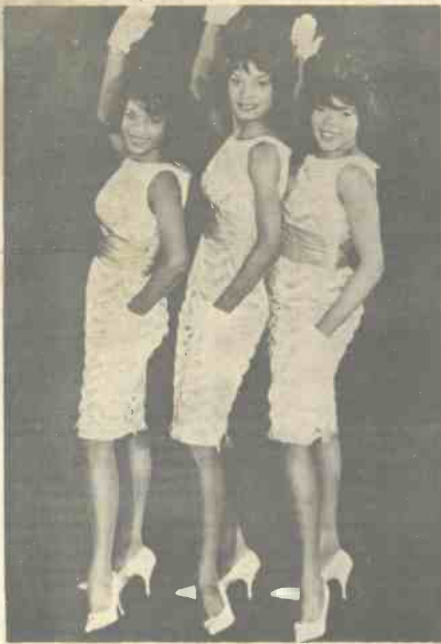
Martha and The Vandellas—Another of those great femme R & B groups that so far have only clicked in a relatively small way here.

A LARGE number of artistes featured in this series have been all on one U.S. label—the Tamla/Motown/Gordy group. Why, I don't know, but the popular theory why these artistes don't click in Britain is that the styles are too well advanced for this country—at least for the great majority of the record-buying population, anyway.