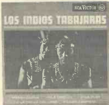
RCX 7135 7 mono EP