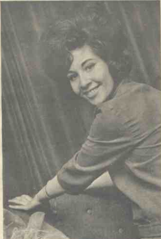
Helen Shapiro takes the Peggy Lee oldie "Fever" and dresses it up well.