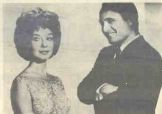
April Stevens and Nino Tempo.