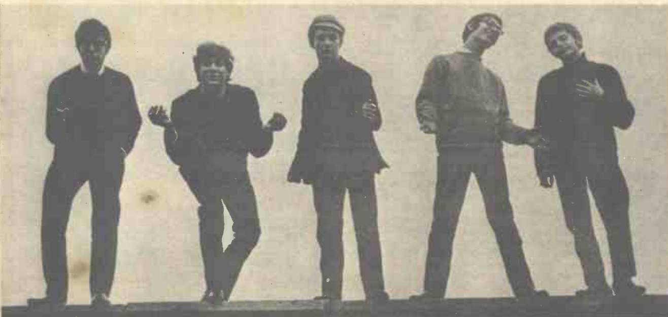
Manfred Mann have a new disc out which they wrote especially for "Ready-Steady-Go."