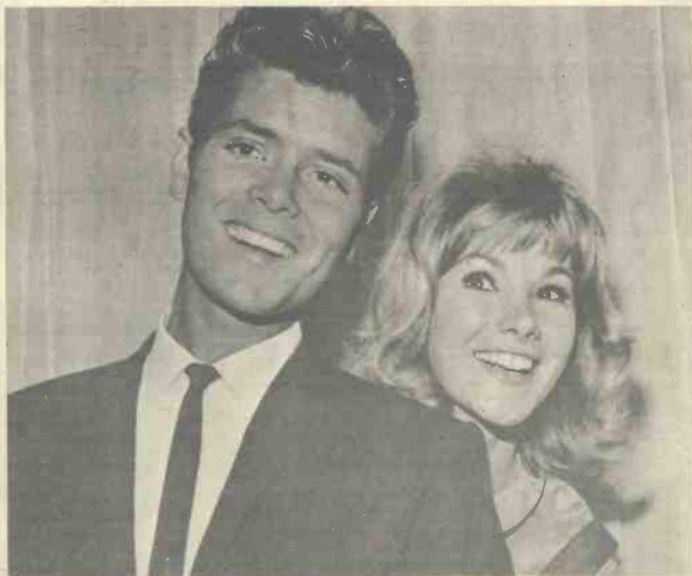
Cliff Richard and Susan Hampshire seen together just before "Wonderful Life" started on location.