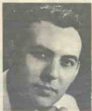
CARL PERKINS—His tour may secure more releases from him.