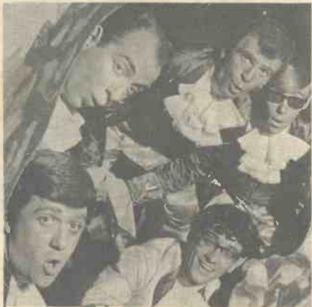
Freddie and the Dreamers in panto garb for "Cinderella" at the Royalty Theatre, Chester. Doing a bomb, we hear.