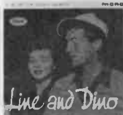
DEAN MARTIN & LINE RENAUD Capitol EAPI-20060