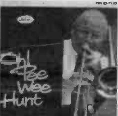
PEE WEE HUNT Capitol EAPI-20109