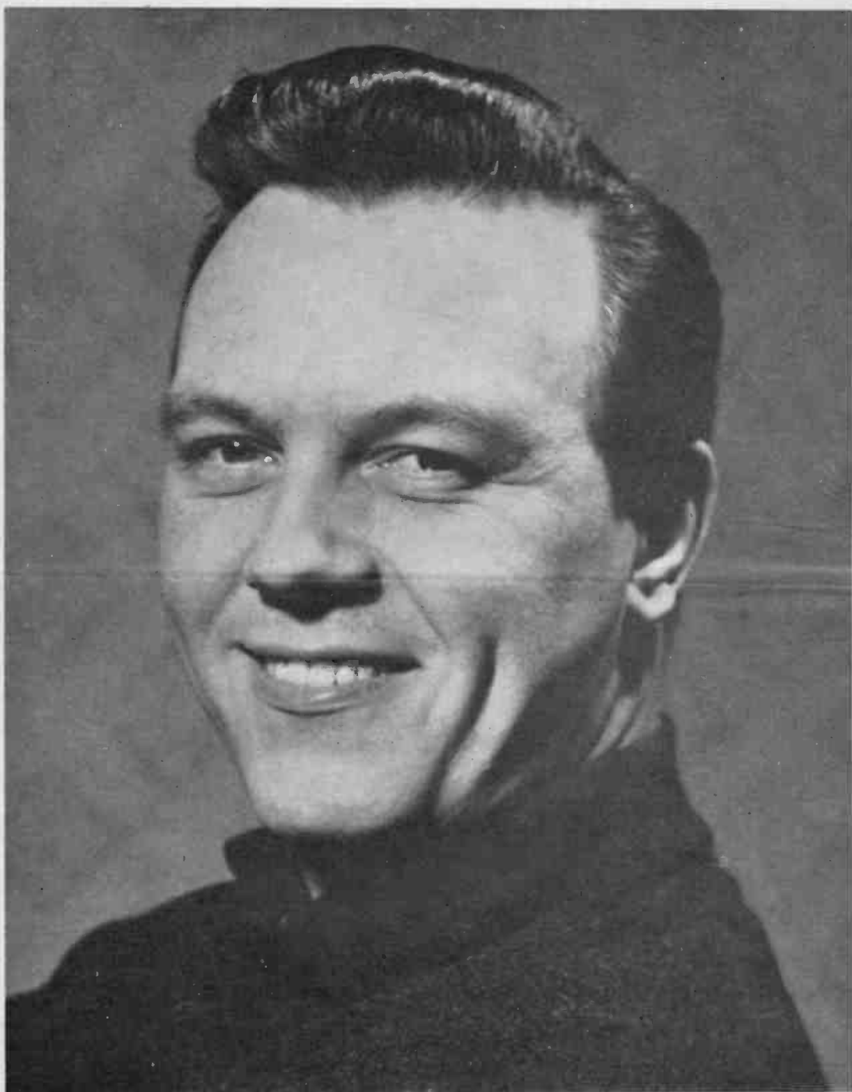
★ ★ ★ MATT MONRO Parlophone recording star follows up his "Portrait of my love" hit with another smash — "My kind of girl" and "This time" (45-R4755).