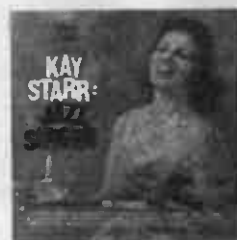
KAY STARR Capitol T1438 *ST1438