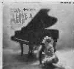
PHINEAS NEWBORN Columbia 335X1311 *SCX3370