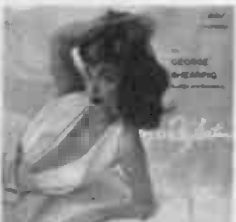
GEORGE SHEARING Capitol T1334 *ST1334