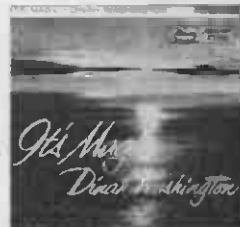
DINAH WASHINGTON Mercury ZEP10102