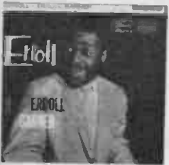
ERROLL GARNER Mercury ZEP10096