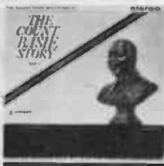
COUNT BASIE (I) Columbia 335X1316 *SCX3372