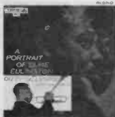
DIZZY GILLESPIE H.M.V. CLP1431