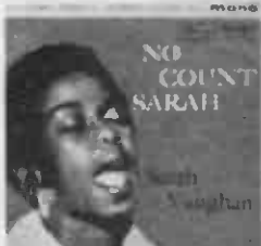
SARAH VAUGHAN Mercury ZEP10101