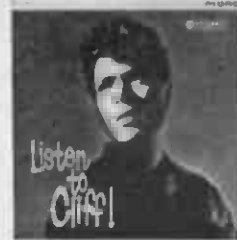
CLIFF RICHARD Columbia 335X1320