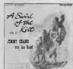
JIMMY SHAND Parlophone GEP8828