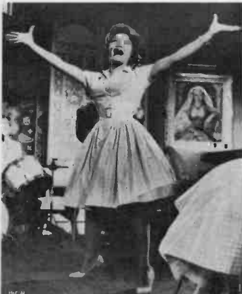
Our picture shows lovely Connie Francis singing one of her numbers in a scene from M-G-M's "Where The Boys Are".

Most important, perhaps, this film is the first that Connie Francis has made. I like her. She is very talented, very nice, both to talk to and to look at. The last time, in fact, that I spoke to her, she told me that her main ambition was to settle down and have, probably, about six children! If she does,