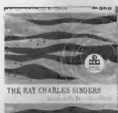
RAY CHARLES MGM-EP-748