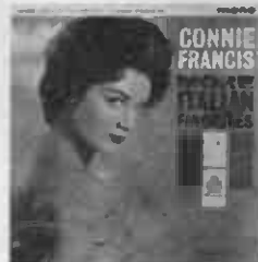
CONNIE FRANCIS MGM-C-854 *CS-6029