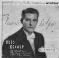
RUSS CONWAY Columbia SEG8079 *ESG7844