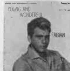
FABIAN H.M.V. CLP1433