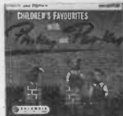
PINKY & PERKY Columbia SEG8084 *ESG7848