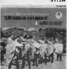
SEVEN BRIDES MGM-C-853