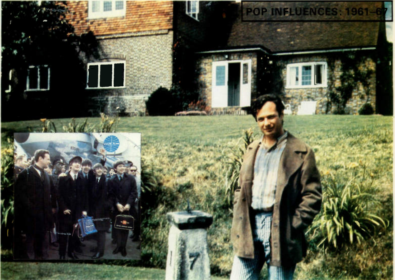
Syndication International Associated Press