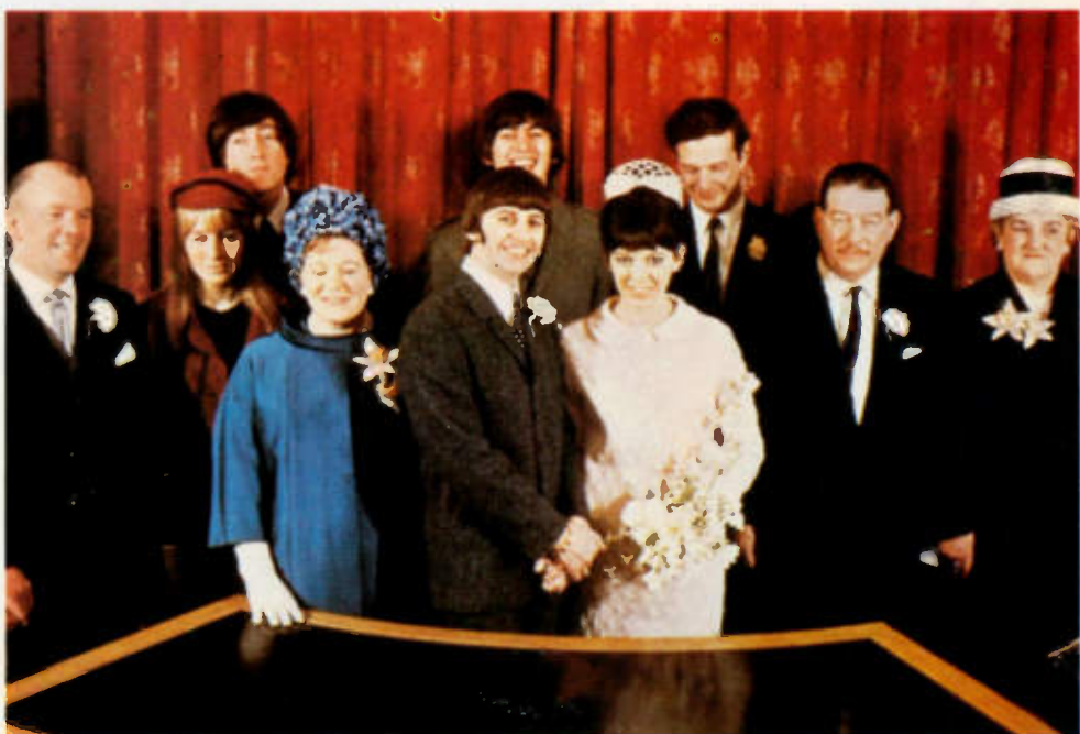
Brian Epstein seen standing behind the bride at Ringo's wedding.

The second meeting took place as arranged, and with all members sitting in his rather plush office Brian said: "You need a manager, would you like me to do it?" There was a pregnant silence, and then John looked up and said "Yes." The others all agreed, and John again said: "Right then Brian. Manage us, now. Where's the contract? I'll sign it." Brian