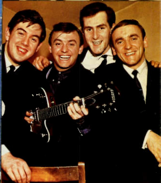
his Merseysound, Gerry and the Pacemakers.

happening there until Brian Epstein finally managed to interest George Martin in his Beatles tapes. The recording industry, in the UK, was centred on London, and as long as Cliff Richard and the Shadows, Billy Fury and Bobby Vee kept on selling records, it wasn't interested in local groups from provincial towns.