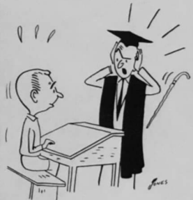
I said name three Famous Battles not three Famous Beatles