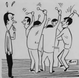
We are a bit different from other groups —we are all Drummers