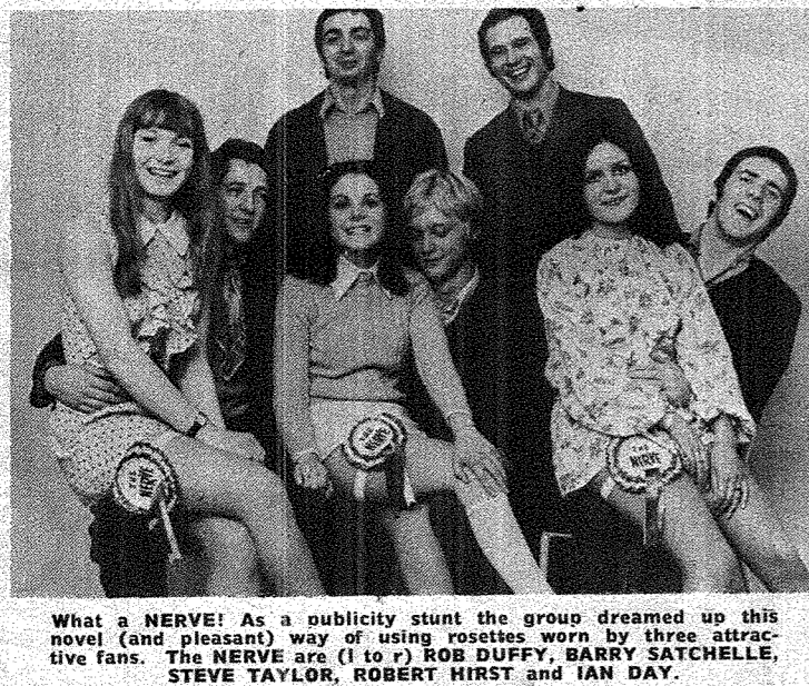
What a NERVE! As a publicity stunt the group dreamed up this novel (and pleasant) way of using roses worn in three attractive fans.