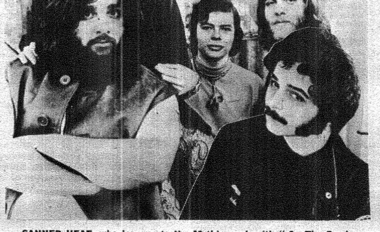
CANNED HEAT, who leap up to No. 13 this week with "On The Road Again," are due to visit Britain next week. The group are (l to r) BOB HITE, ADOLFO DE LA PARRA, AL WILSON, HENRY VESTINE and LARRY TAYLOR front.

and that Bob the Bear and Henry the Sunflower love collecting old records. According to Larry—and he says the others feel the same—he's personally more interested in what he's playing than in fame and success.