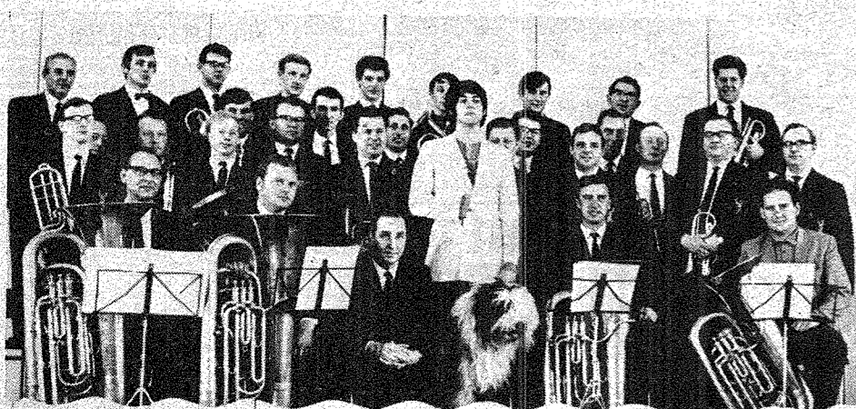
The Black Dyke Mills Brass Band

Mary Hopkin: Those Were the Days - An Apple single. Number 2.