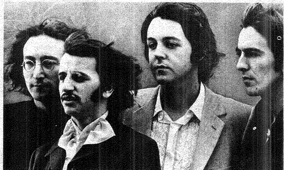
John, Paul, George and Ringo.

The Black Dyke Mills Brass Band: Thingummybob - An Apple single. Number 4.