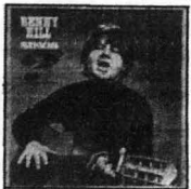
BENNY HILL Benny Hill Sings (?) NPL 18133 Pye Popular