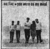
WE FIVE You Were On My Mind NPL 20067 Pye International