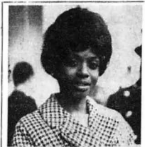
Fontella Bass could well have been singing "Rescue Me" when she flew into London airport on Wednesday. For the singer, up to No. 16 in this week's chart, faced a two-hour wait until officials traced her work permit.