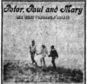
PETER, PAUL & MARY See What Tomorrow Brings W 1615 WS 1615 Stereo Warner Brothers