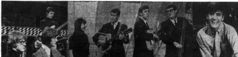
Pop stars on TV—at 'Ready, Steady, Go!' are PETER and GORDON with a young lady admirer and a Dakota; the chart-topper SEEKERS recording 'Billy Cotton Music Hall' to be seen tomorrow (Saturday); set back at RSC, the boys BILL Y. J. and KRAMER