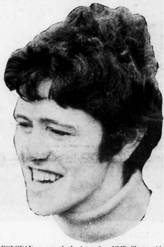
DONOVAN comes back into the NME Chart with "Colours"—and looks pleased about it.