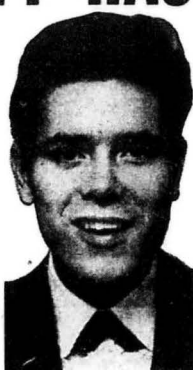
CLIFF RICHARD—another song recorded in the U.S.