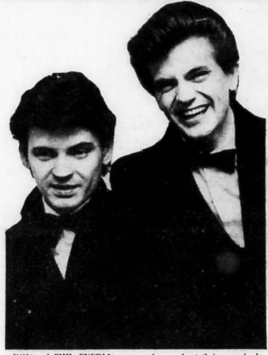
DON and PHIL EVERLY are very happy about their come-back to the Top Ten. "The Price Of Love" is at No. 3!

ELVIS becomes a sheik-type in his next film, "Harem Scarem." His latest disc, "Crying In The Chapel," shoots to No. 6 in this week's NME Chart.