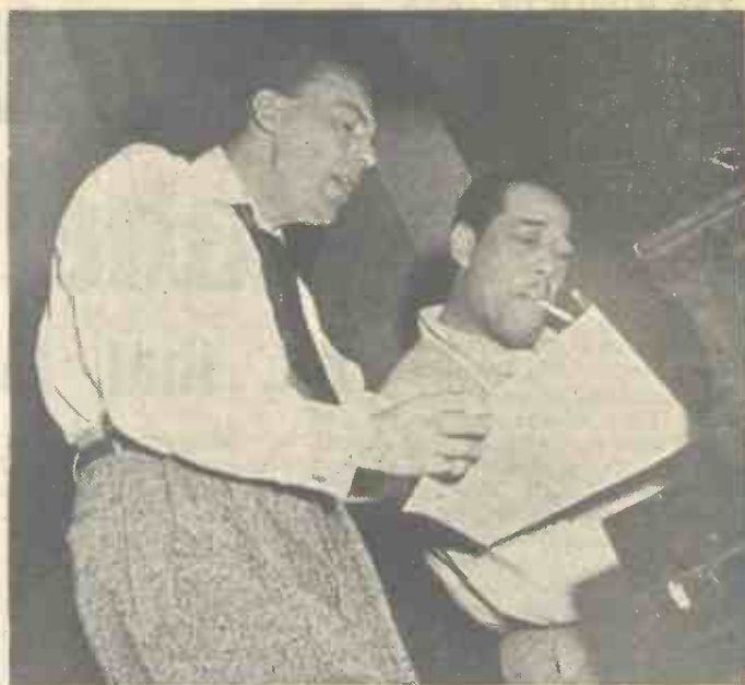
In working mood, Duke Ellington discusses a vocal problem with Woody Herman.

But Ellington's artistic ideals rose far above upward limits