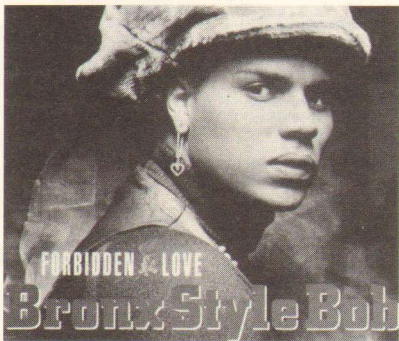
Forbidden Love - Sire EHR/AC