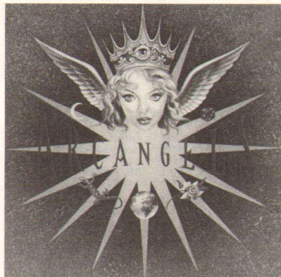
Arc Angels - DGC R/EHR