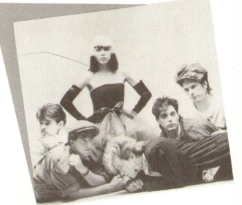
Berlin - Currently shooting up the European Airplay top 50 with the love theme of Top Gun, 'Take My Breath Away'.