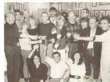
Executives All Over The World. Phonomag International executives are seen celebrating the re-signing of Record Records. For the special occasion Phonomag delegates flew in from Norway, Belgium, Spain, Greece, France, Holland & Italy.