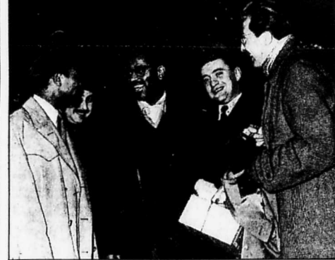
Dizzy Gillespie arrived in Paris on Monday with a trunkful of tinned apple juice. He's up on weight!