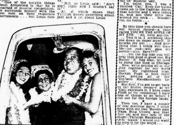
A Royal farewell for Louis and Lucille (2nd from left) at the Honolulu Airport. With the Armstrongs are two Hawaiian fans.