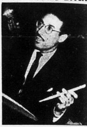
Max Roach, Paris, 1949.