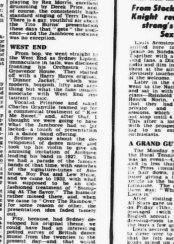
The Lewis in connection of the microphone.