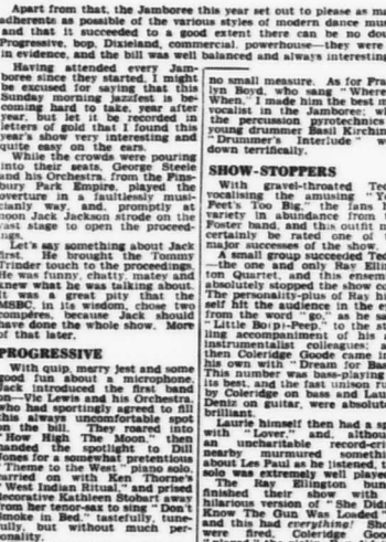
The Lewis in connection of the microphone.