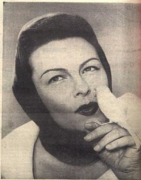
German singer ILSE WERNER, the first of the continental stars to be brought to this country by the new record company, Qualiton.

Sam Cooke, whose biggest hit was "Only Sixteen," has been signed up by R.C.A. Records. Formerly his records were released in Britain by H.M.V.