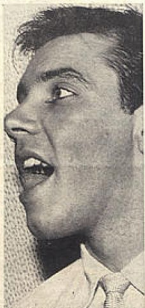
MARTY WILDE—I want to be an actor.