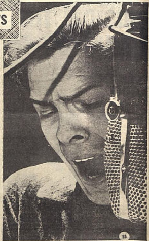
The new release by JOHNNIE RAY will take its time—but it could get there.