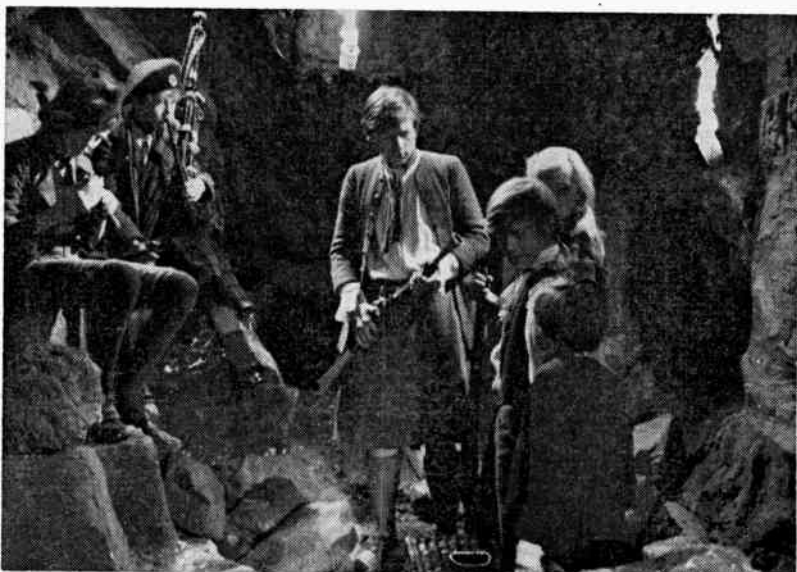
Summer Camp, Monday to Thursday at 5:00 p.m., presents this week a drama entitled the Young Jacobites, about two boys who find themselves suddenly in another era.