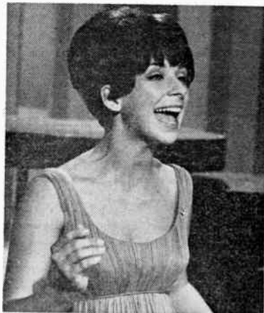
Joanie Sommers is guest star Monday at 9:00 p.m. on CBC-TV's Summer Music Hall.