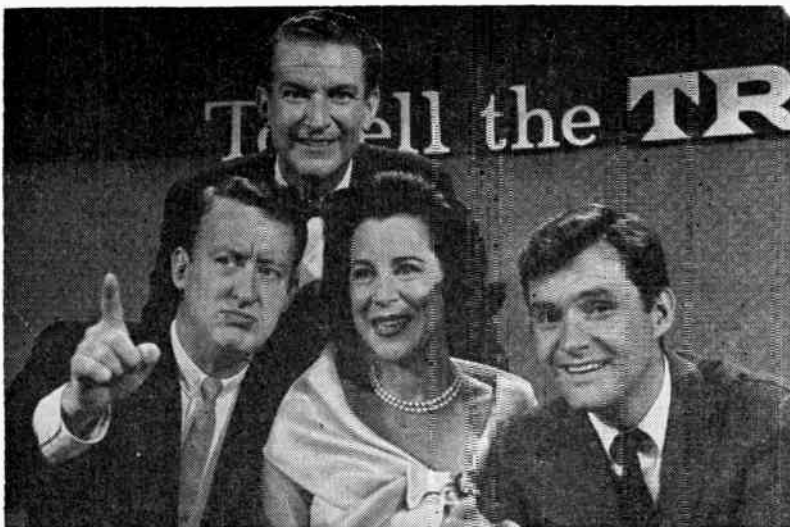
Kitty Carlisle, centre, with Tom Poston, left, and Orson Bean, regular panelists, and host Bud Collyer, top.

"I have met a lot of wonderful people across Canada in the ten years that I have had my own weekly show and I have loved every minute of it despite the pressures that exist in producing a weekly show," says Juliette, "but I am truly looking forward to the extra challenge of the one-hour format."