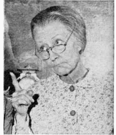
One of the guest contestants Monday to Friday on Password is Irene Ryan — "Granny" of the Beverly Hillbillies.