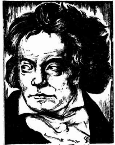
Beethoven's music is discussed Monday at 11:03 p.m. on the new series, The Language of Music .