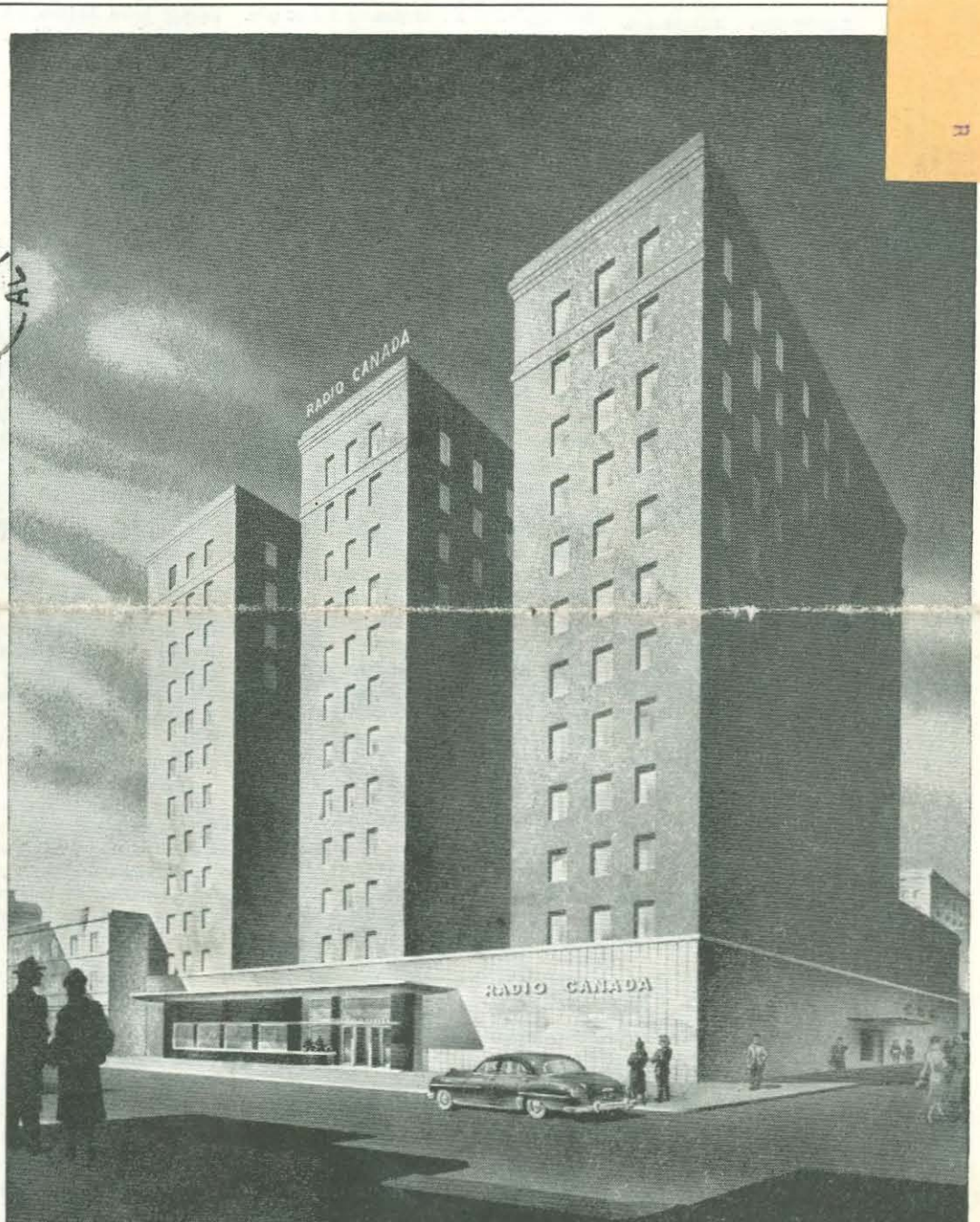
The Radio Canada Building, Montreal

The Radio Canada Building, above the studio and control room level, looks much the same as any other office building except for the variety of work being carried on. In the Transmission and Development Laboratories, CBC engineers do research, test equipment, and plan technical projects. In the Plant Maintenance Department, they attend to the repair of equipment. In the Architectural Department, draftsmen work at plans and blueprints for structural work: whether the need is for a new studio in Newfoundland or British Columbia, the work begins here, on the drafting tables. The offices of the International Service are