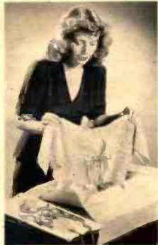
A filmy bedjacket, made from the old tablecloth, is soon ready for Christmas packing.