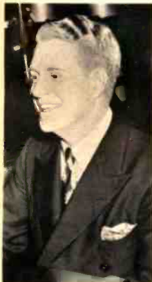
Nelson Eddy sang on the series for the first time last summer and was then signed up to repeat on November 8th and January 24th.