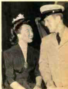
COAST GUARD LIEUT. RUDY VALLEE