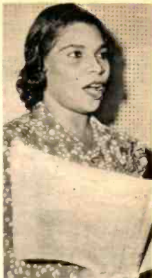
Marion Anderson has sung for the "Great Artists Series" a half-dozen times and is scheduled for December 15th and January 17th.

Great artists are glad to return to his program, time and again—as shown by the picture-schedule on this page, giving dates of guest appearances for the winter. Himself a conductor, as well as pianist, Iturbi speaks for many when he describes Voorhees as "the most thorough conductor in music today."