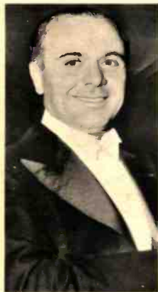
Jose Iturbi, eminent Spanish musician, plays his dynamic piano for the third time on the Telephone Hour program of February 7th.