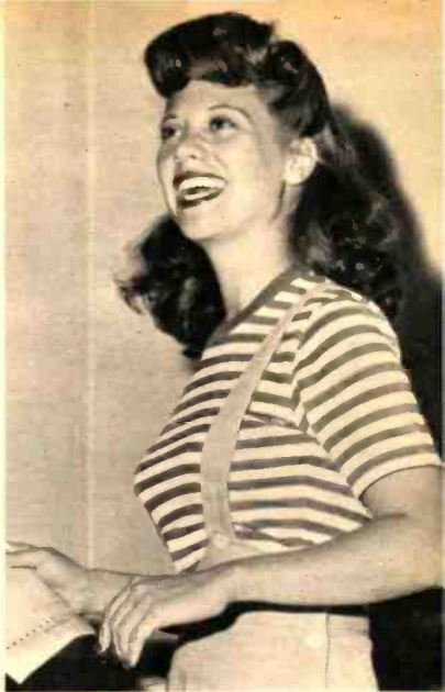
"A.E.F.'S SWEETHEART" DINAH SHORE IS A FREQUENT GUEST

THE RCA VICTOR CHORUS, LIKE THE RCA VICTOR ORCHESTRA, IS A REGULAR FEATURE ON THE HOUR-LONG "WHAT'S NEW?" SHOW