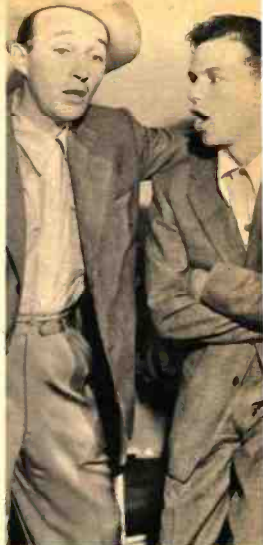
BING CROSBY WAS HIS FIRST INSPIRATION

Truthfully, I believe that these well-wishers are asking very little and giving much. A pat on the back from the foreman in the mill, or a kind word from the boss in the office, is a great stimulus to better effort. It's no different with the performer. His audience is, after all, his boss, and encouragement works just the same, coming from them. I'll always be grateful for those pats on the back—just as long as I get them and as long as I try to deserve them.