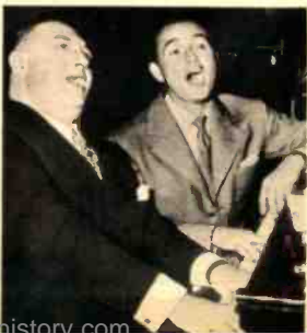
COMPOSER MACK GORDON and maestro Freddie Martin prove that they can sing out—as well as make tuneful music.