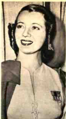
Lily Pans and her coloratura soprano will be starred in the series for the eighth and ninth times on November 29th and January 31st.