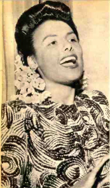
SEPIA SINGER LENA HORNE, SIGNED FOR SEVERAL APPEARANCES