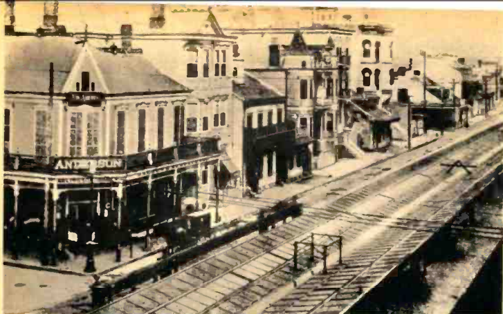
NEW ORLEANS' ORIGINAL BASIN STREET IS SHOWN AS IT APPEARED FIFTY YEARS AGO WHEN IT WAS THE BIRTHPLACE OF AMERICAN JAZZ