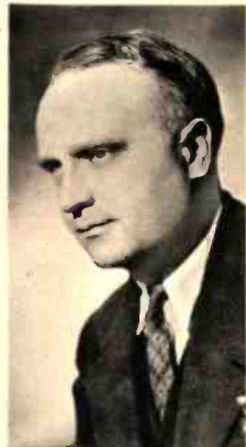
Robert Casadesu, noted French pianist and composer, returns to the Telephone Hour for his second piano recital on December 6th.