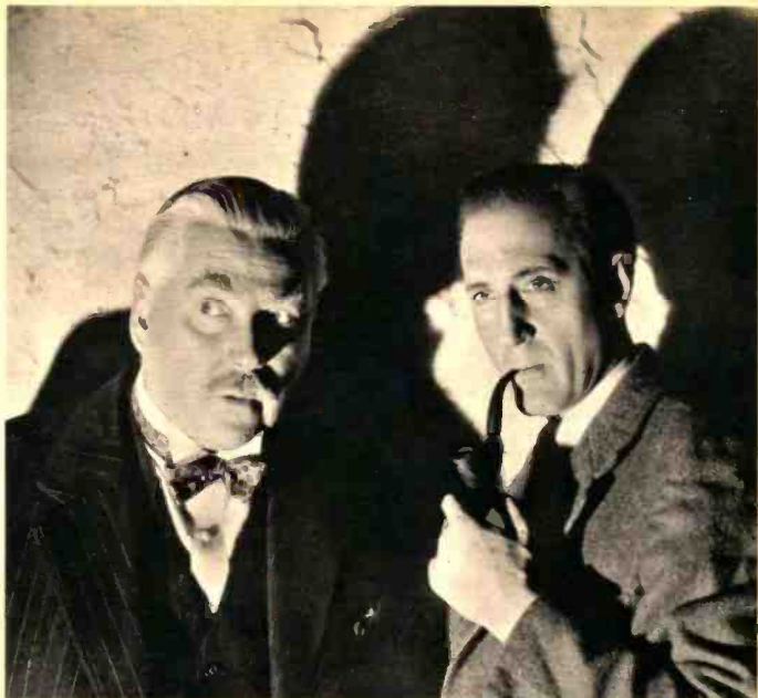
DR. WATSON (NIGEL BRUCE) GIVES MORAL — BUT HARDLY INTELLECTUAL — SUPPORT TO KEEN-EYED SHERLOCK HOLMES (BASIL RATHBONE)