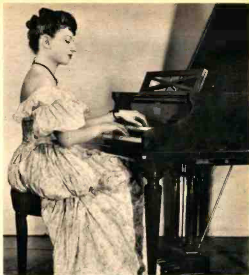
SYLVIA MARLOWE DONS APPROPRIATE COSTUME TO PLAY THE MELLOW NOTES OF LONG AGO