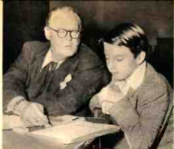
LIONEL BARRYMORE discusses the script of CBS "The Mayor of the Town" with Conrad Benyon, who plays his radio protegee, Booth .