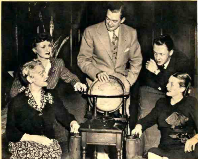
THE KEY CHARACTERS IN THIS DAYTIME SERIAL DRAMA ARE ELLEN COLLINS, RUTH ANN AND DR. BOB GRAHAM, SAM AND JANET RYDER