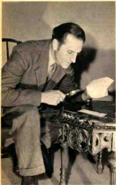
HOLMES INSPECTS A CLUE WITH HIS INDISPENSABLE MAGNIFYING GLASS