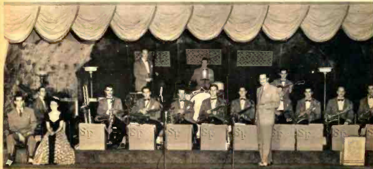
HERE'S MAESTRO FIELDS WITH THE ENTIRE "NEW MUSIC" ORCHESTRA: NINE SAXOPHONISTS, FOUR RHYTHM BOYS AND TWO VOCALISTS