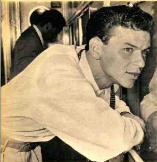
FRANK SINATRA'S GRATEFUL FOR HIS SUCCESS—AS HE EXPLAINS IN HIS OWN STORY

CLOSEST TO HIS HEART ARE HIS WIFE, NANCY, AND HIS DAUGHTER, NANCY SANDRA