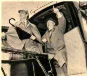
THE PAIR FIND SPEEDY HANSOMS NANDY FOR HOT PURSUITS

The pair combine in these thrillers with eminent success, as they pile up evidence and chase their quarry through the English country lanes and crowded London streets they know so very well.