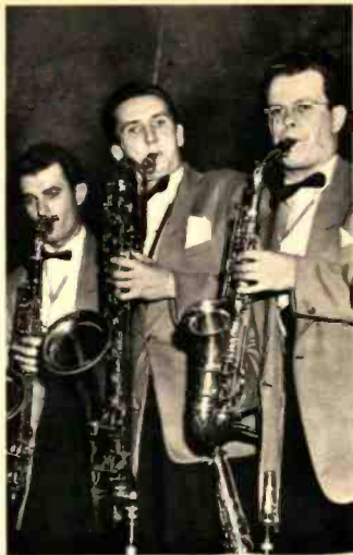
SAXES ARE THE HEARTHROB OF SHEP'S "NEW MUSIC" BAND