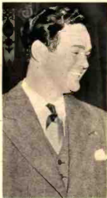
James Melton, star of the Telephone Hour for two years, now "guests" on the series—November 22nd, February 14th, March 20th.