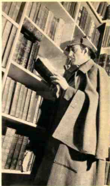
THE SLEUTH REFERS TO A VOLUME IN HIS BOOK-LINED STUDY

Both actors are eminently suited in appearance and trafting to the roles they play (on screen for Universal, as well as on the air for Mutual). Wiry, six-footer Basil Rathbone made his entrance into the world in dramatic fashion at Johannesburg, South Africa, during threatened native uprisings. After forsaking an engineering career to join a stock company managed by his cousin, Frank Benson, his schooling in old English roles was interrupted by the first World War—in which he received the Military Cross. Since then he has been a stage, screen and radio, favorite on both sides of the Atlantic.