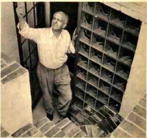
HE LOVES TO SHOW VISITORS THE STURDILY-CONSTRUCTED BASEMENT BOMB SHELTER