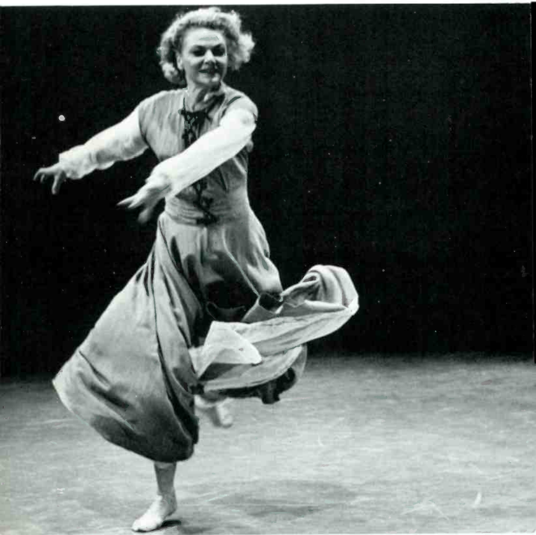
Valerie Bettis "As I Lay Dying" Camera Three