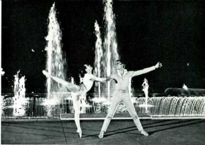
Maria Tallchief, John Butler Bell Telephone Hour