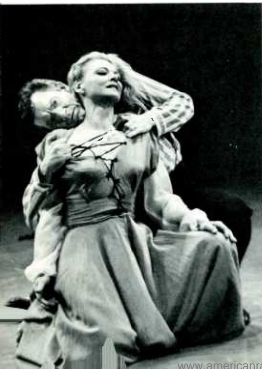
"As I Lay Dying" Camera Three

I am a union member, but I think we have begun to throttle the creative purpose. I think some unions must begin to backtrack, and re-evaluate their importance. American dancers are the best trained I have seen, but so many other unions have beat them to the punch that they earn nowhere near their worth. It has become a habit, after everyone has gotten in his claims upon the people doing the show, to reduce the number of dancers. There must be so many stagehands, so many electricians, so many musicians—but no one who speaks for the dancer says, "You must have 20 dancers." I am in favor of everyone making a living, but I think it has gotten out of hand. Before I became a choreographer, I often thought that even dancers were asking for the wrong things. Something has been lost sight of.