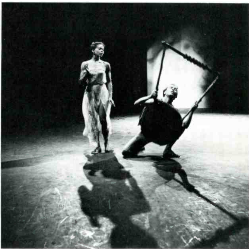
Mary Hinkson, Glen Tetley "Adventure"