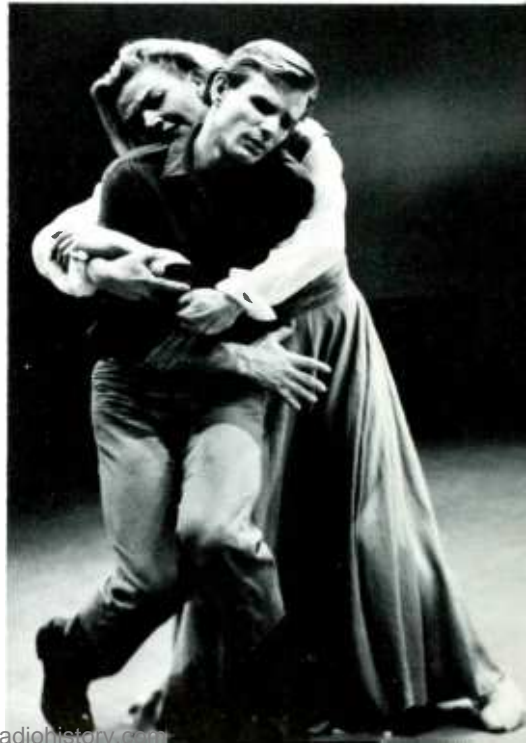
"As I Lay Dying" Camera Three

But I ought to qualify my enthusiasm for techniques generally. Certainly TV can allow a kind of presentation the proscenium cannot. You can go to four sides instead of one. You can take a camera in a circle around action—all around it, under it, and above it. But I am not really inclined to admit that TV has advanced the form of dance. I've seen little that is different from musical shows. I can't think of an instance when I've seen any dance on TV that has not previously been seen on the stage or in night clubs. Perhaps the dances of ethnic groups might be an exception, but that applies only to audiences outside New York. My family sees very little dance except what TV brings to them, and consequently they are impressed with the June Taylor dancers. They would also be impressed with Radio City Music Hall dance. But the New Yorker would find that hardly novel. The camera makes new technique possible. It makes it easy to put over a small piece of business. It aids in giving dance a narrative thread. It can give dance a flow that the movies cannot provide—but I don't think it has really introduced new forms at all.