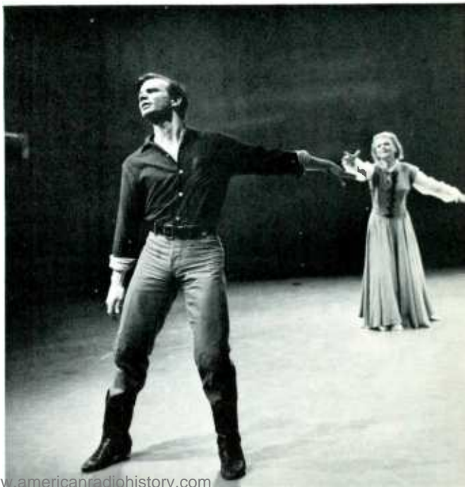
“As I Lay Dying” Camera Three

If we are to get new work and emerging forms, yes. The analogies already exist. Since opera became “respectable,” ballet is being increasingly accepted. The contemporary dance is being given more