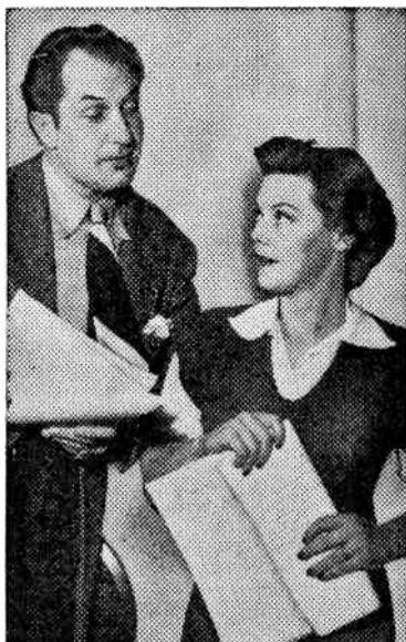
THE SAINT —Vincent Price heads the cast of this Sunday night thriller. Price talks things over with director Helen Mack. It's on WOW at 6:30.

Great moments in literature dramatize at 1 p.m. on "NBC Theater." This hour-long program of radio adaptations of famous works of fiction has won many commendations and awards for high quality of subject matter and excellence of performance.