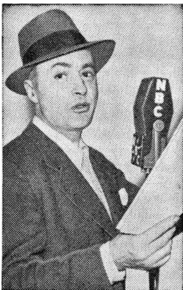
ADVENTURE —Charles Boyer portrays a gay rogue who usually falls in love with his intended victims. It's "Presenting, Charles Boyer" Tuesday nights.

The quiz type show is a favorite too. On Sunday nights it's "Take It or Leave It" at 9 with Eversharp's emcee Jack Paar. Tuesdays, quotemaster Bob Trout hurls quotes of the week at a panel of guest experts.