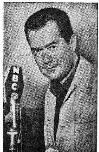
MYSTERY —Frank Lovejoy stars as newsman Randy Stone on "Nightbeat" Mondays at 9 p.m. The series is one of Wheaties "Big Parade" programs.