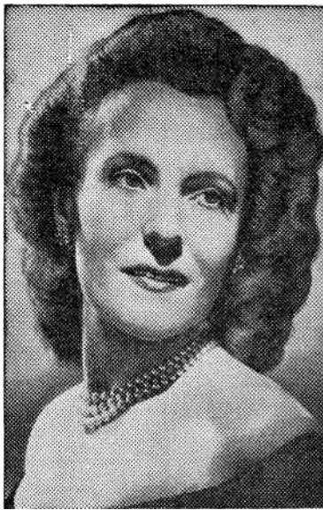
NBC SYMPHONY —Jarmila Novotna, lyric soprano of opera and films, will be guest soloist on this U. S. Steel hour Sunday, August 13 at 7:30 p.m.