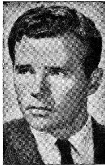
ADVENTURES OF SAM SPADE —Howard Duff plays the hard-hitting private eye Sam Spade each Sunday night at 7 o'clock. Wildroot airs this series.