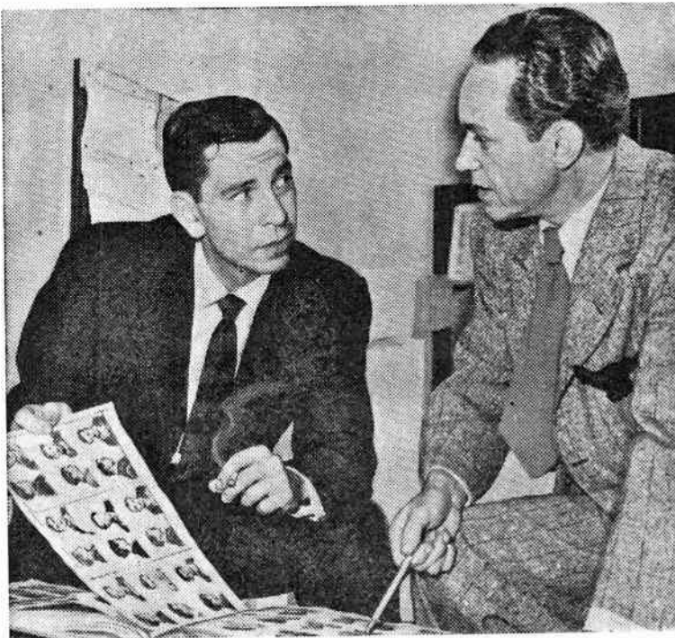
DRAGNET —Jack Webb, left, and Barton Yarborough, who portray Detective Sergeants Joe Friday and Ben Romero, respectively, on "Dragnet," the Thursday night police drama series, check through the files of the Los Angeles Police Department. The programs are based on actual police cases.

At 9:30 Liggett and Myers Tobacco Company air the exciting police drama series, "Dragnet." The much-lauded show presents true cases from the files of the Los Angeles Police Department.