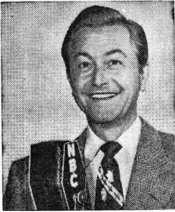
FATHER —Handsome Robert Young plays the father of three in the popular Thursday night comedy show, "Father Knows Best," at 7:30 on WOW.