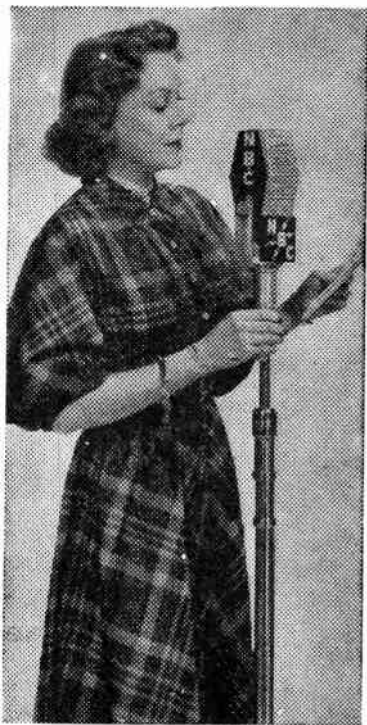
THE RIGHT TO HAPPINESS —Lovely Claudia Morgan, who stars as "Carolyn Kramer" in this NBC daytime drama, is pictured in the dress especially fashioned to represent her show.

Since the kickoff fashion show in New York, women throughout the country are taking to these new popular priced dresses. Every woman who has ever listened to a radio serial seems to have an interest in the new line of spring and summer dresses.