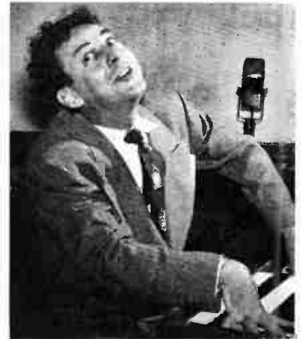
George "Behind the Eight Ball" O'Hanlon, radio and screen comic, heads NBC's new situation-comedy program, the "Me and Janie Show," beginning July 12.