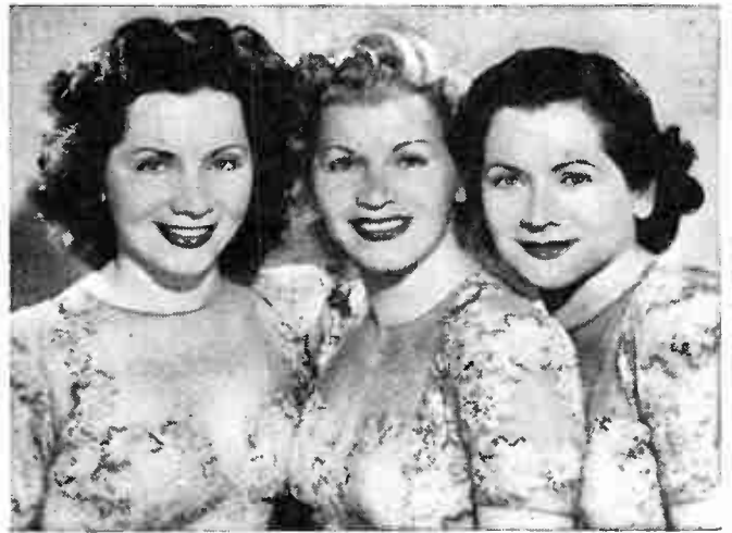
How do you like them? Blonde, brunette or redheaded? The Fontane Sisters, NBC's "Supper Club" are "one of each." Left to right are Geri, redhead; Margie, blonde, and Bea, brunette.