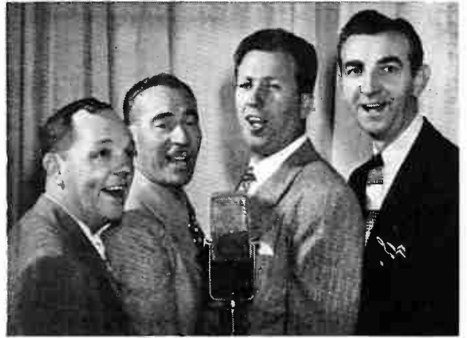
Together since 1929, the King's men offer a musical program in the Tuesday spot vacationing "Fibber McGee and Molly."