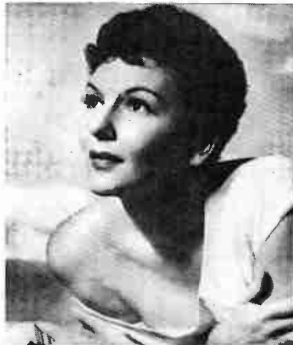
Mary Martin, star of the Broadway musical hit, "South Pacific," is one of many stars who participate regularly in WOW's transcribed musical programs.