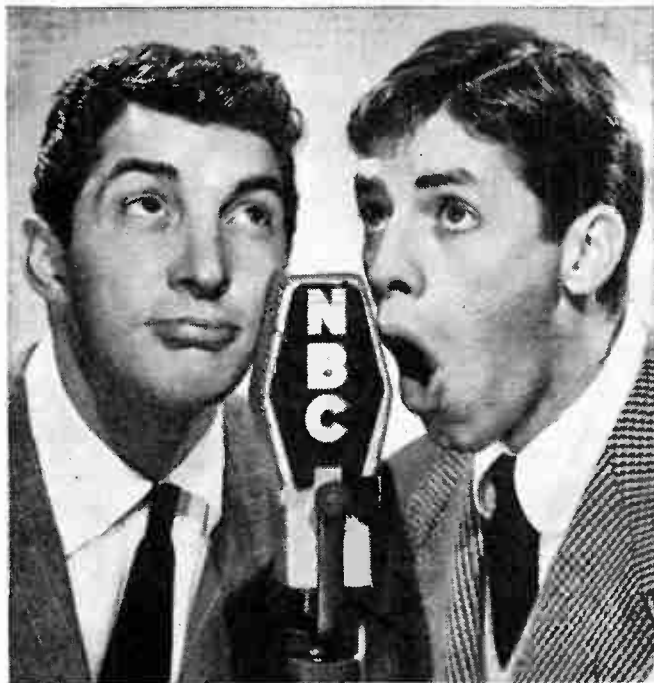
It's Jerry Lewis (right) who has his mouth open, but it's his partner, Dean Martin (left) who's singing. This NBC team is now in the Bob Hope Tuesday spot.