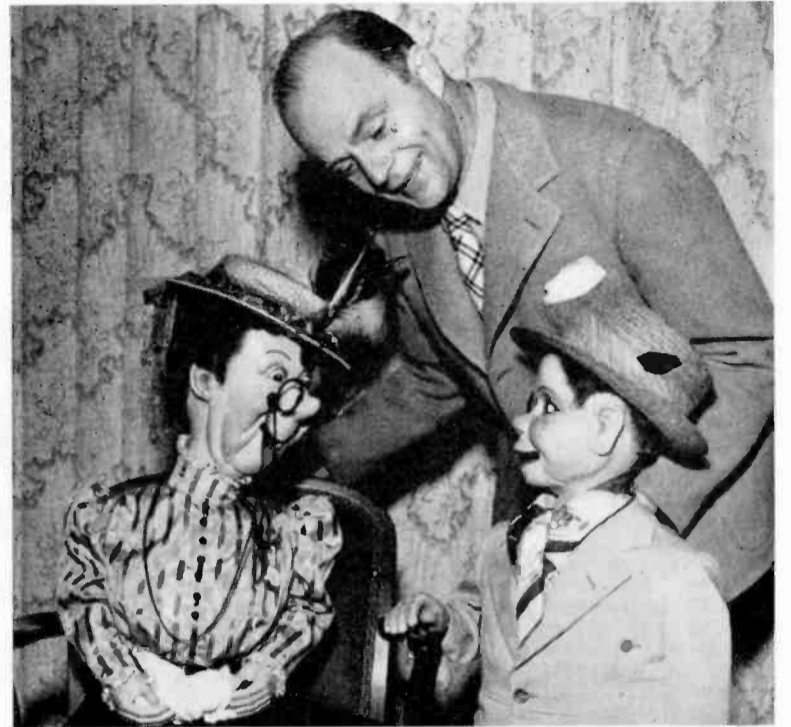
A tremendous event in OCTOBER was the introduction of "Effie Klinker," a new character on the Edgar Bergen Chase & Sanborn show. "Charlie McCarthy was none too happy about sharing the spotlight.