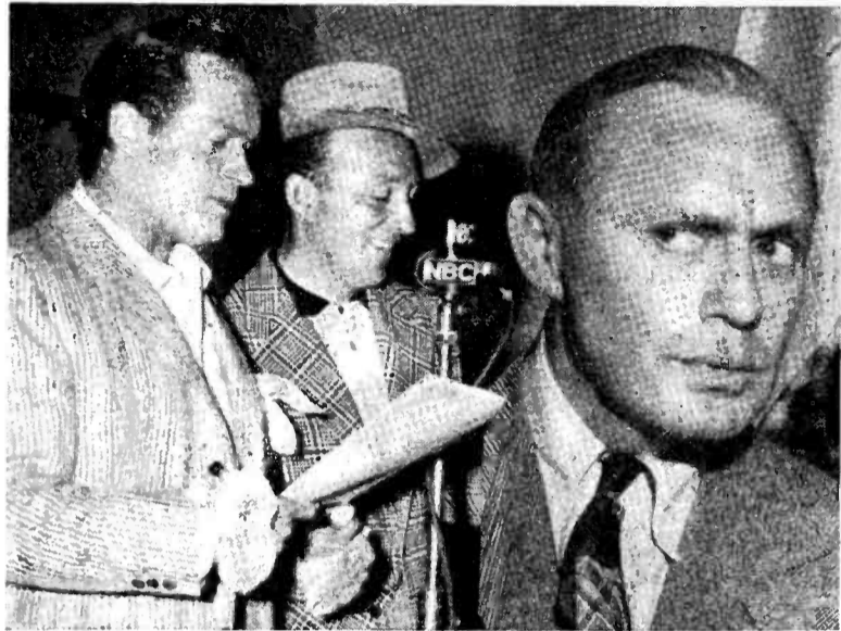
When exciting 1944 began last JANUARY, the big three in radio were Bob Hope, Bing Crosby and Jack Benny. The year of '44 will end that same way—and from all indications they'll be on top for many years to come. Also in the "Top Four" are the Fibber McGees, pictured just across the page.