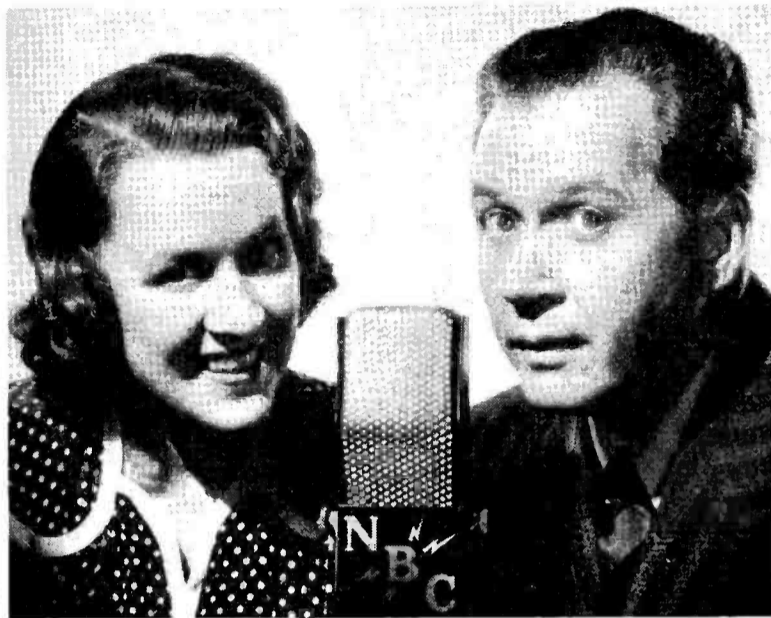
APRIL was renewal time for the "Fibber McGee and Molly" Johnson Wax show on NBC-WOW. In 1944, Fibber had pneumonia and was off the show when the 52-week renewal was written. Molly carried on as did "Beulah," Harlow and the others.