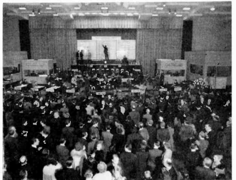
When NOVEMBER rolled around the most important of all national elections found NBC and WOW both set to give excellent news coverage service. Photo shows the main NBC studios in New York on election night.