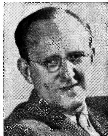
KAY KYSER . . . dean of the "Kollege of Musical Knowledge" and champ soldier entertainer, returns to his former Wednesday night spot on October 4.