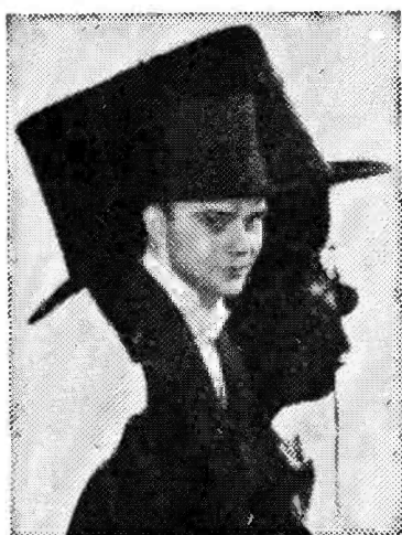
EDGAR BERGEN . . . Chase & Sanborn's great ventriloquist, who returned with his impish stogie, Charlie McCarthy, on September 3.

Tuesdays (no date set yet), 9 p. m., the Bob Hope program, with Jerry Colonna and Frances Langford.