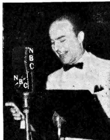
RALPH EDWARDS . . . spent the summer gathering new gags for his "Truth or Consequences," which returns to NBC and WOW on Saturday night, September 9.