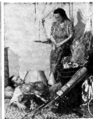
FIBBER AND MOLLY . . . (Mr. and Mrs. Jim Jordan) top-notch program on the air, returns to WOW October 3. Undoubtedly Fibber will include again his great closet-door crash gag.