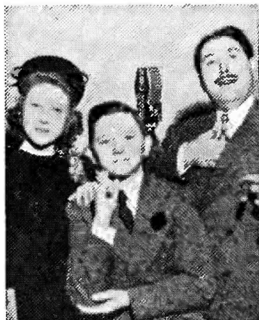
THE GREAT GILDERSLEEVE . . . shown with "Leroy" (Walter Tetley) and Niece Marjorie (Lurene Tuttle), will come back on WOW on September 3.