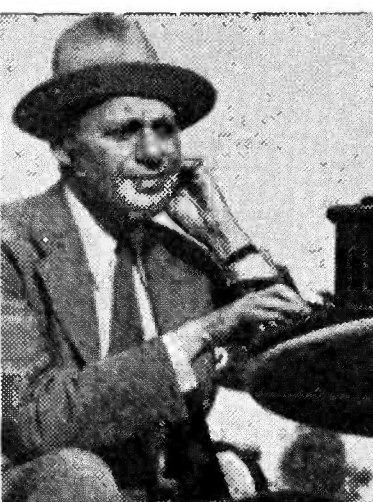
JACK BENNY . . . with Mary Livingstone, "Rochester" and Don Wilson return for a new sponsor on the Sunday 6 p. m. spot, starting October 8.