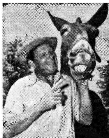
BOB BURNS . . . the Arkansas Traveler, will be back with his bazooka and a hilarious new program setup to pep up the Thursday schedule on October 5.