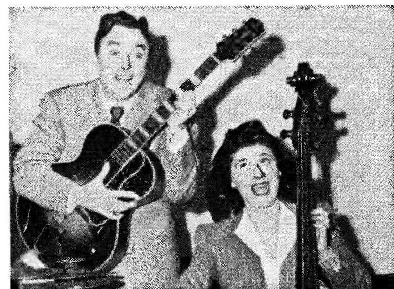
JOAN DAVIS and JACK HALEY . . . co-proprietors of the "Village Store," came back early (August 31) and started off the season with a gay new show. Will Joan really get a man this year?