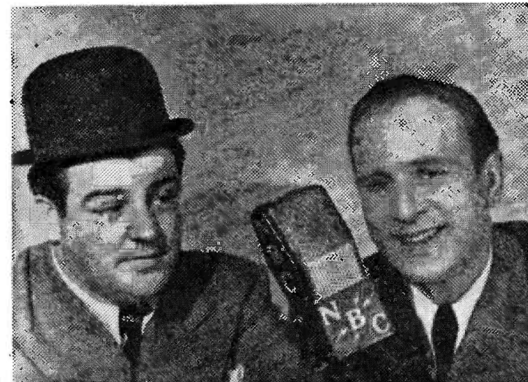
BUD ABBOTT and LOU COSTELLO are due back on October 5. There'll be laughs every second in this Thursday nighter during the fall and winter season on WOW.