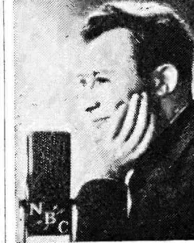
INFORMATION PLEASE . . . will again be emceed by the famed book reviewer, Clifton Fadiman, aided by John Kieran, Franklin P. Adams and Oscar Levant, starting September 11.