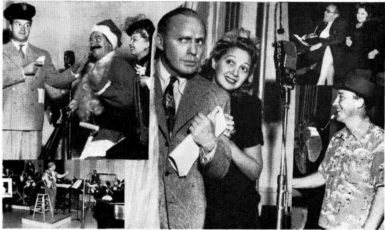
"These are the men who make them laugh . . ." These are the Champions of Champions and the top comedy and music stars of radio. All three are WOW-NBC stars, with Bob Hope in first, Jack Benny in second and Bing Crosby in third place. In these days of tragedy, of bad news, of worry, of fear, of uncertainty, "these are the men who make them laugh . . ."