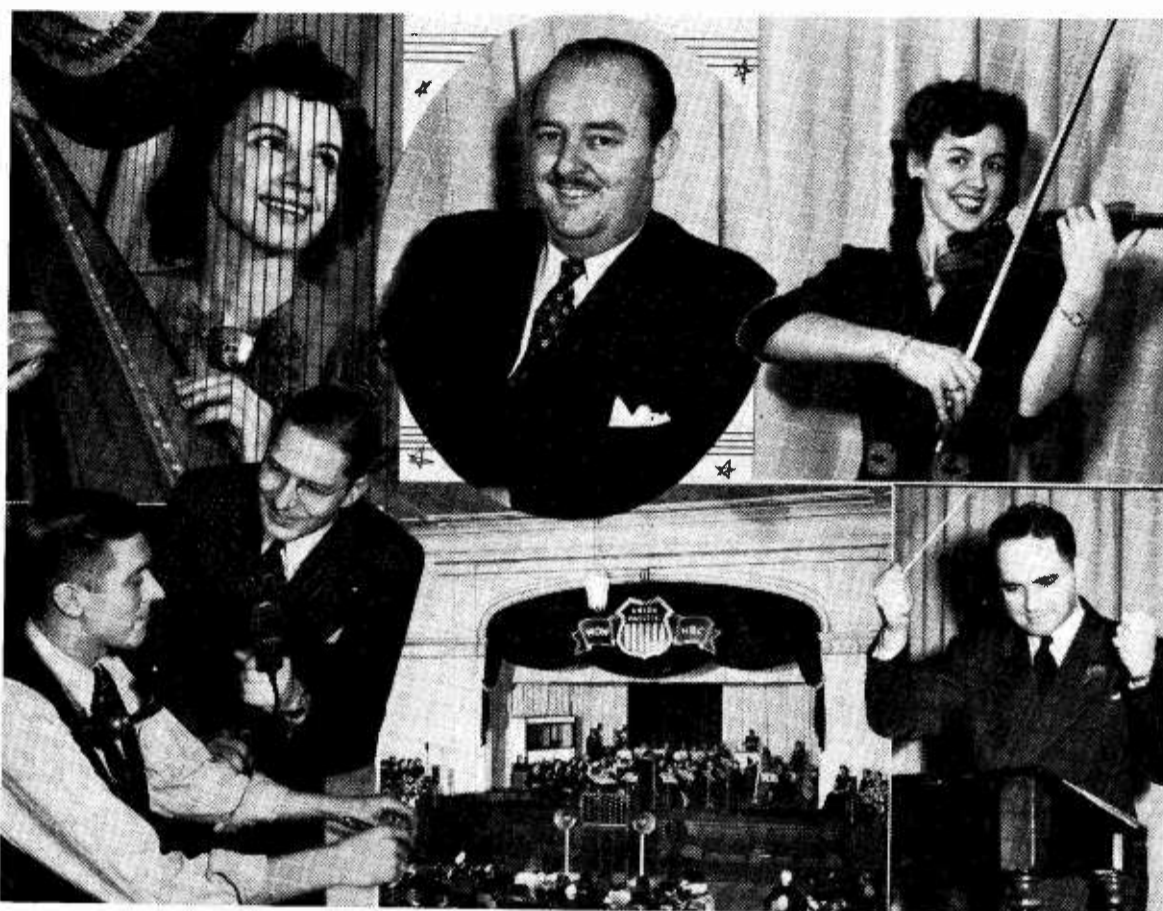
Everybody wears a big smile now at rehearsals of Union Pacific's "Your America." Show No. 1 is all set for 4 p. m., Omaha time, January 8, as these photos indicate.