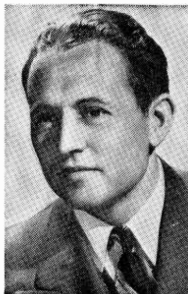
ART LINKLETTER . . . The emcee of "People Are Funny," used to be a champ in basketball and swimming. Apparently it was good training for his present job, in which he keeps his listeners roaring.

News Tower readers asked for these photos. Write and let us know others whose photos you'd like to see.