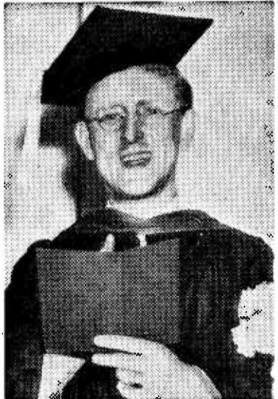
The one and only Kay Kyser... keeps both service folks and civilians smiling.

A few copies of Radio WOW's Global War Map (Second Edition) are still available, free, with new or renewal subscriptions to the WOW News Tower. The map folder includes new maps, corrected to September 1, 1943, of all theaters of war. The war map may be purchased for 15 cents by anyone who is already a regular subscriber to the WOW News Tower.