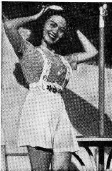
CONNIE HAINES . . . Half pint in size, Connie Haines really wows 'em when she performs on the Abbott and Costello show. Despite her youth, she's a veteran among radio's top-notchers.