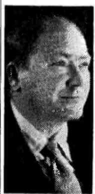
John Charles Thomas