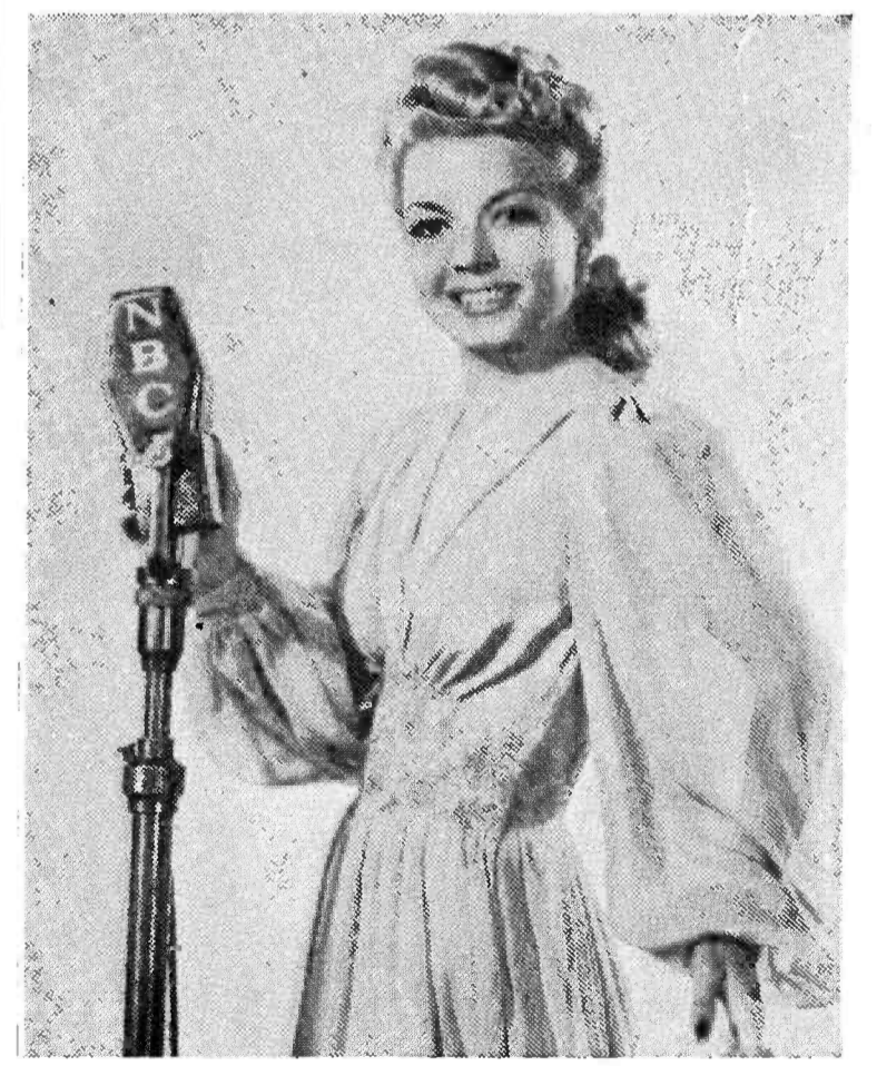
"This is one reason . . ." Lovely, blonde Frances Langford is one of the reasons Bob Hope's show is so extremely popular. She has definitely helped make Hope's show a favorite with service men before whom Bob and Frances Langford have performed. Even with the natural quip ability of a Bob Hope, it takes a "chic" little personality like Frances to help do the trick.

Door Canteen." NBC's "Cavalcade of America" took third place.