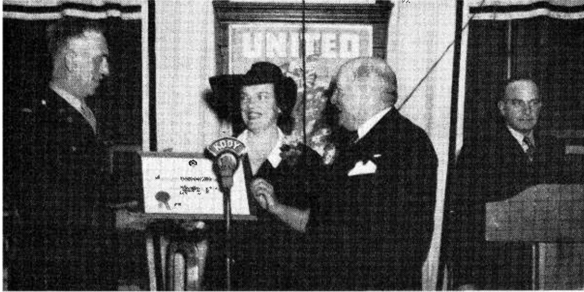
Within less than a week after it opened, Station KODY at North Platte set up a coast-to-coast hook-up, telling listeners of 142 NBC stations about North Platte's Service Men's Canteen. Photo shows principals during that broadcast.