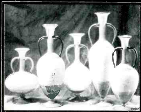
Glass by Alan Goldfarb