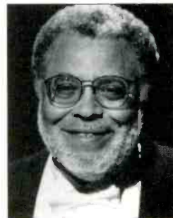
James Earl Jones

The Composer's Voice, FM93.9, Sundays, 3pm