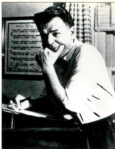
Rodgers & Hammerstein Organization

WNYC RADIO CELEBRATES THE LIVES AND WORK OF SOME OF THE GREAT TALENTS OF MUSIC IN JULY WITH SPECIAL PROGRAMS ON OSCAR HAMMERSTEIN, LORENZ HART, LEOPOLD STOKOWSKI, AND DAVID DIAMOND