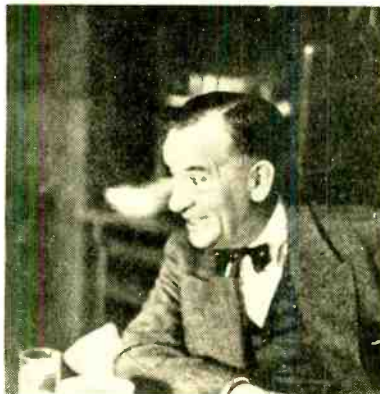
POET Eddie Guest of NBC's Welcome Valley show (Tues. 7:30 p. m., CST, WJZ net) is caught at lunch by the candid camera.

SAVE MONEY on RENEWED & GUARANTEED USED CARS & TRUCKS