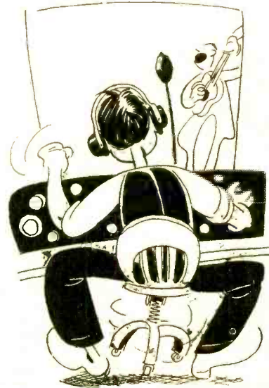
"He'll soon be ready for his try-out on the amateur hour."