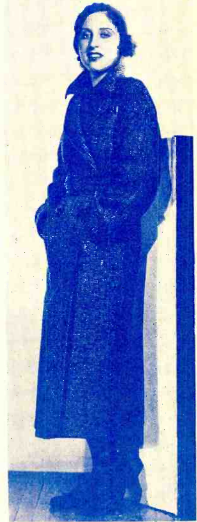
Tweeds for roaming.

F OR the girl who likes to go roaming around the city in the daytime—as I do—notning is so satisfactory as a plain tweed coat. Rum-maging through the quaint old shops in the "brass-town" section of lower Manhattan, I don't feel conspicuous in such a model as I might if sport-