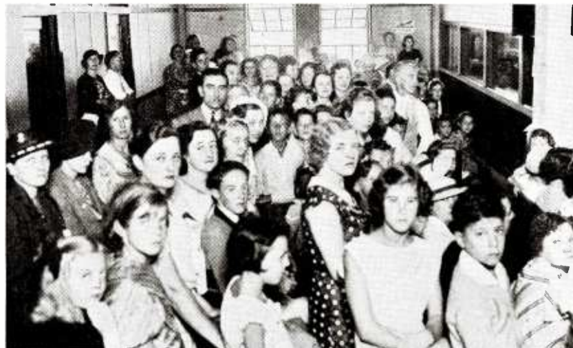
A typical Little Theatre crowd turns from watching a broadcast long enough to look pleasant for the cameraman.