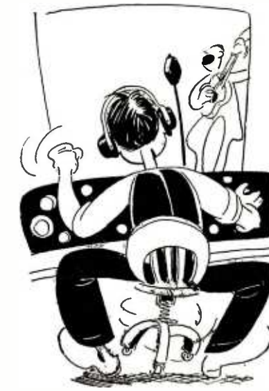
"He certainly will be headed for the last round-up if he blasts that mike."

So, if you want to truly live Above earth's murk and mire, See clearly what you want to do, Then match it with Desire.