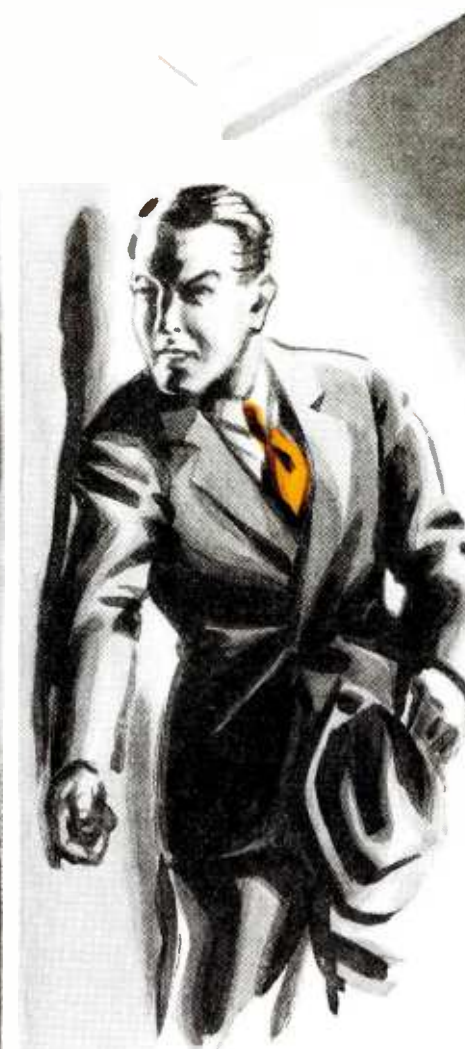
"And furthermore, don't tune me in."

a swell voice already. Don't you think you could make a lot of people happy if you sang on the radio? They like you in your church solo work, don't they?"