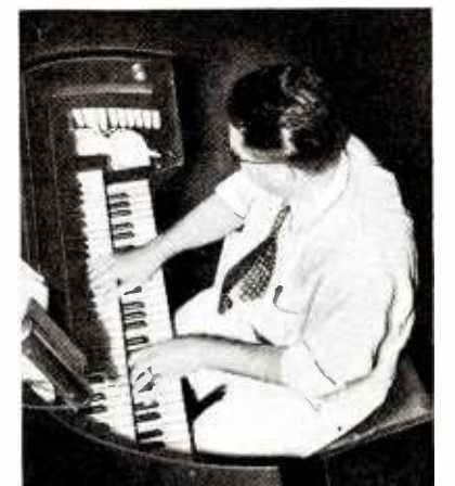
Ralph Waldo Emerson is not ordinarily a man to be looked down upon, but the camera out-foxed him this time. Note all the "equipment" Ralph has at his finger tips.