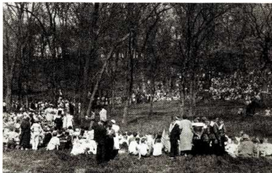
Part of the crowd of 10,000 that attended the Winnebago County Rural Music Festival.