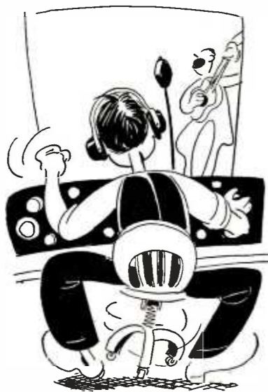
"Hmm, a cavity in his bicuspid."