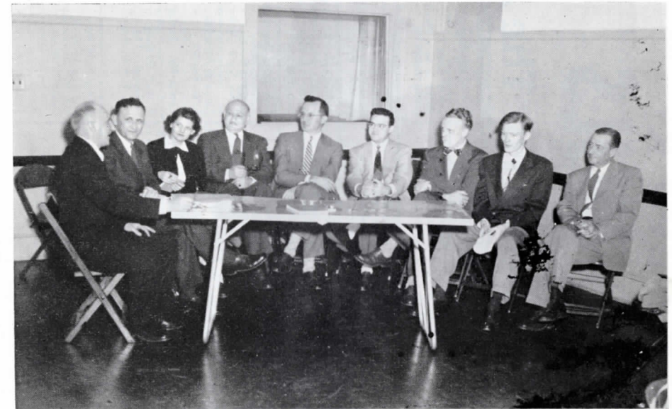
Shown above are the folks from WJLS, WWNR, and the C. and P. Telephone company who met with a representative of the Federal Communications commission on setting up plans for the Conelrad System operation in event of an air raid attack here. Also seen is a representative of the local newspapers.

Another point brought out by the F-C-C personnel present was that the radio personnel, both at the transmitters and studios would remain on the job throughout the alert or attack, whichever the case might be, thereby risking their lives to be of service to the citizens of this area.