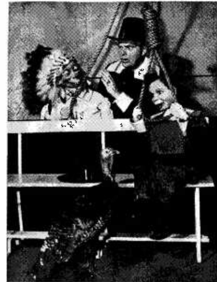
Much to the dismay of Edgar Bergen, Mortimer Snerd and Charlie McCarthy are intent upon putting the noose on the turkey they've picked for their Thanksgiving Day feast.