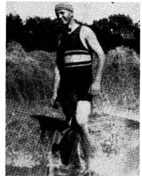
Bathing Beauty a la Curtis—1918 model.

They is thousands of men dat breathe, move, and live; pass offen dee stage of life and ain't heard of no more. Why? 'Cause dey didn't do a smiggin' of good in dis old war weary worl'. Dat's why. Nobody wuzz blest by 'em . . . as dee parson of Greasy Rock Church would put it . . . nobody could point to 'em as the instrument of their redemption; their light went out in dee darkness and they jest ain't remembered no more.