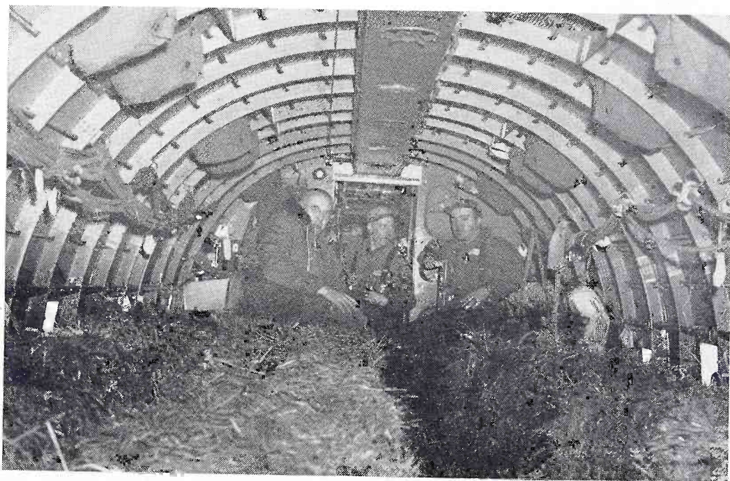
Gene and two of the C-47 crew ready for "Operation Hay Lift" take-off.

It was just about four weeks ago that we made one of the first trips out from the Topeka base in an Air Force C-47 with a plane load of hay, bound for Alliance, Nebraska. We loaded our recording gear on top of the hay bales, and bundled up in heavy flying jackets and boots. I know we must have looked like a party of Eskimos; (Continued on Page 11)