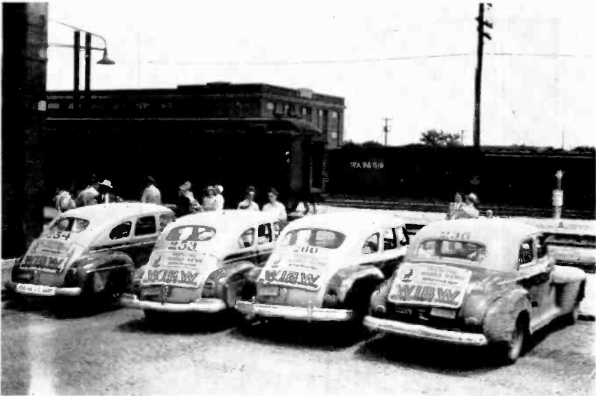
Topekans are kept up to date on WIBW schedules by these Yellow Cab posters.