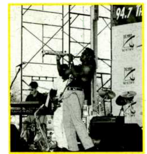
Everette Harp - Smooth & Saxy