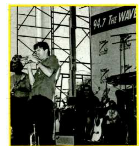
Trumpeteer Rick Braun

INSIDE THIS ISSUE: The WAVE Music List Concert and Event Listings Programming Guide Artist Spotlights: Anita Baker & Norman Brown