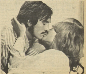
TROY (Terence Stamp) awakens his new bride.