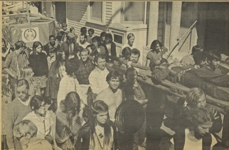
SYMBOLIZING THE "DEATH OF THE HIPPIES" the flower children of Haight Ashbury in San Francisco hold a funeral procession and carry a "dead" hippie on a slab, followed by a symbolic 25-foot casket and a sign proclaiming "The brotherhood of free men is born."