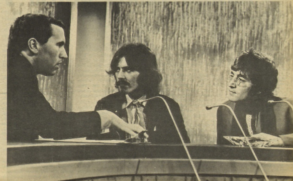
GEORGE HARRISON AND JOHN LENNON DISCUSS TRANSCENDENTAL MEDITATION WITH TV HOST, DAVID FROST (left).