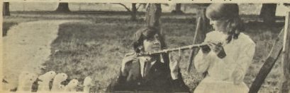
GABRIEL OAK (Alan Bates) shows Bathsheba (Julie Christie) how to play the flute.