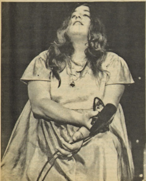
MAMA CASS AND two missing blankets and a set of keys!!!

WILL RINGO STARR be forced to look like this again for "Candy"?