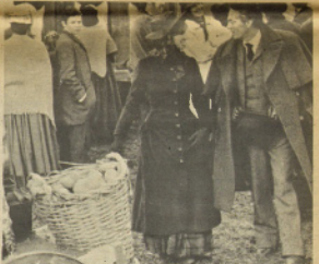
BATHSHEBA is escorted to the Circus by Boldwood (Peter Finch).

To be sure, people will flock to see "Madding Crowd." It is perhaps worth it. Most people will never be able to travel to Dorset in England, and certainly none of us will ever be able to return to the middle 1800s which the film so faithfully and beautifully re-creates. But as a film it dies; without valid characters, with superfluous distracting shots, and unforgivable melodrama, "Madding Crowd" emerges as a pitifully empty film.