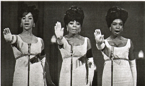
TOP RECORDING TRIO — THE SUPREMES, as they appeared on last week's "Hollywood Palace," on ABC Television. Show was hosted by film star Tony Randall. SUPREMES are rated as the number one female vocal group in the nation since the ANDREWS SISTERS and THE McGUIRE SISTERS. Their top hit STOP! IN THE NAME OF LOVE has hit the top. (l-r) Florence Ballard, Diana Ross, and Mary Wilson.