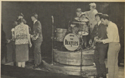
THE BEATLES IN HOLLYWOOD. Experts put finishing touches on amazingly realistic wax figures of the Liverpool Four. When wax figures were delivered to TUSSAUD'S in Hollywood, hundreds of excited fans stood in rain to watch the figures carried in and set in place. After the final touches were made on THE BEATLES set, doors were opened. Although exhibit is behind heavy glass, special guards are on duty at all times to protect the visitors — and the museum!