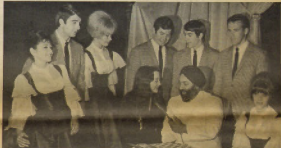
HERE'S SPOONY AGAIN — talking to actress CAROLYN JONES, who appears regularly on TV series, The Addams Family. The pretty witch added just the right touch of mystery to opening of TUSSAUD'S WAX MUSEUM, 6767 Hollywood Boulevard, near Highland. Museum features Chamber of Horrors, Movie Monsters, and many presidents of the U.S. In addition, DeVincenti's LAST SUPPER, and Liverpool's THE BEATLES. Museum is open 7 days a week 'til 2:00 a.m. — but if you go, watch out for KING KONG — who roams the dark corridors silently and swiftly.