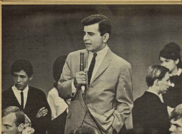
CASEY KASEM, top rated KRLA deejay, as he appears on the new television show starring the personable and informative man of music. The show, "SHEBANG," is seen daily on Channel 5, KTLA. Viewers actually participate in show with contests, and performers appearing recently include some of top stars in show biz. Casey combines live talent with special film clips of outstanding performances. Popular show is produced by Bill Lee and Hall Galli and film is syndicated nationally by television star Dick Clark.