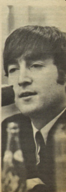
And we were going down from the tops, so I suppose we were above average. It takes a long time if you're in a big class of forty. They can't teach you properly.