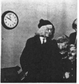
Uh, ah! The boys discover the subliminal! * please . . . yes, collect!" The boys are from the room contest! And you're all invited!