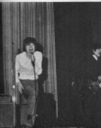
everyone's all time favorite, (except, of course, we will pay a surprise visit to K'R'L'A*M*D