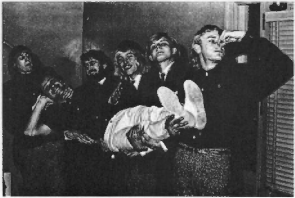
"We're taking you back to England, luv!" Ringo seems to be trying to say something . . . but he didn't mean it! They invited Dave to come to England and stay with them when he got there!