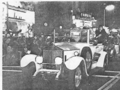
In the meantime, the Emperor and his Gold Sells Royce went riding along, surveying his subjects. The Emperor was cheered along the whole parade route, and can't wait till next year!