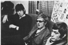
This is one of the few pictures ever taken of Andrew Oldham, the Stones' manager and producer of all their records. He has also written many of their songs with Keith and Mick, who also wrote "As Tears Go By," Mariannne Faithfull's record. Keith was so tired, he fell asleep!