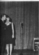
... in the world, were on the just now column right here in the BEAT to see her at the paper, she'll get Maryanne Faithfull.