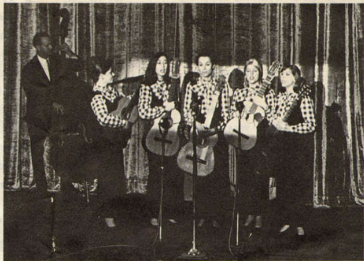
Onstage, the Womenfolk entrance the audience with their beautiful harmony. Most of the songs the acts did were new to the audience, which added even more to the evening's enjoyment.