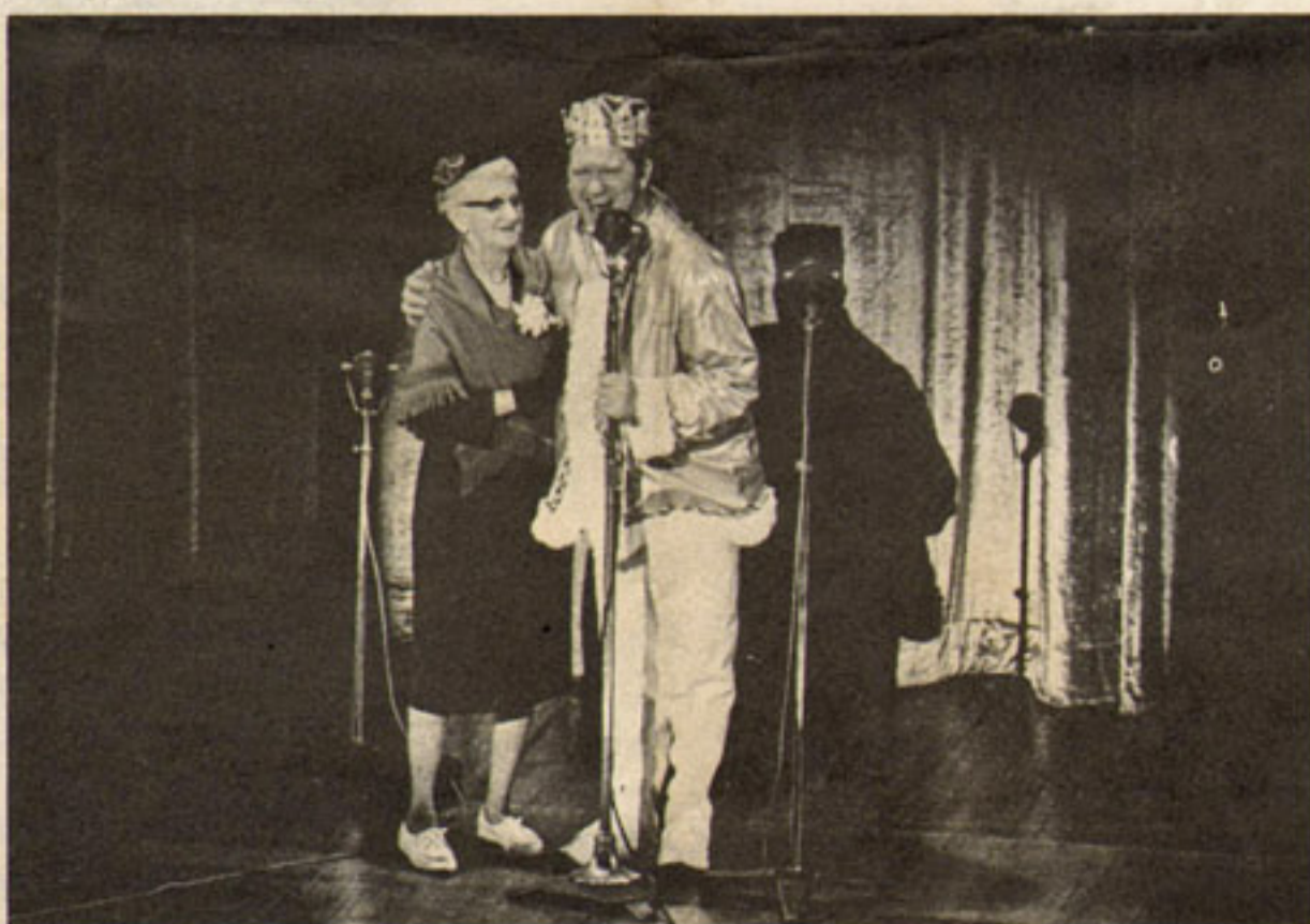
And guess who introduced the L.O.L.? None other than our own Emperor! The two had the audience in stitches, and people backstage couldn't stop laughing either! Those two are too much!