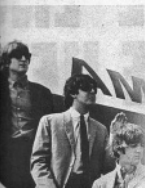
After days of breathless excitement, here are the pictures of their whole story