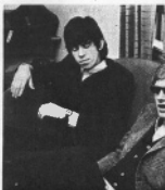
This is one of the few pictures ever taken of manager and producer of all their records. He sings with Keith and Mick, who also wrote the Beatles' record. Keith was so good, he fell