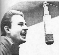
the last take . . . and by the happy smile on his face, this one was it! It came out even better than everyone and looks like a hit!