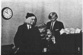
Uh, oh! The boys discover the switchboard! "Hello, Liverpool? Stage Stars, please . . . yes, collect!" The boys are from Hull, and live in a beautiful 80 room castle And you're all invited!