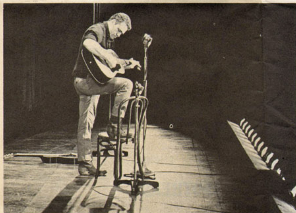
Hoyt Axton, well known to all folk fans, gave a performance that made everyone's spine tingle. They loved him! Every act on the show was so good no one could pick a favorite!