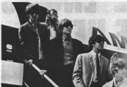
Who will ever forget this wonderful day! After days of breathless excitement, the Beatles finally arrived! And of course, all the pictures of their whole stay were in the first issue of the BEAT!

Ever since the KRLA BEAT started, you have been able to see some of the grooviest pictures in the world of all the top names in the record world, along with real behind-the-scenes pictures of KRLA's d.j.s. These pictures have been taken exclusively for the BEAT, and you will never see them anywhere else. Which leads to a problem! So many of you have requested more pictures of the Beatles, the Dave Clark Five, The Stones, and all the other groups, that we've decided to print highlights from all past issues! So here it is, the best of the BEAT!