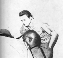
in a few notes in the arrangement as the piano player and the record will be out in a few weeks. Wouldn't it be make it his D.J. pick?