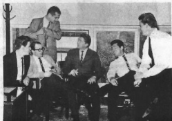
The d.j. meeting! Our d.j.s. meet once a week to discuss the programming policy and make suggestions. Everyone helps to make KRLA number one and keep it there . . . even you!