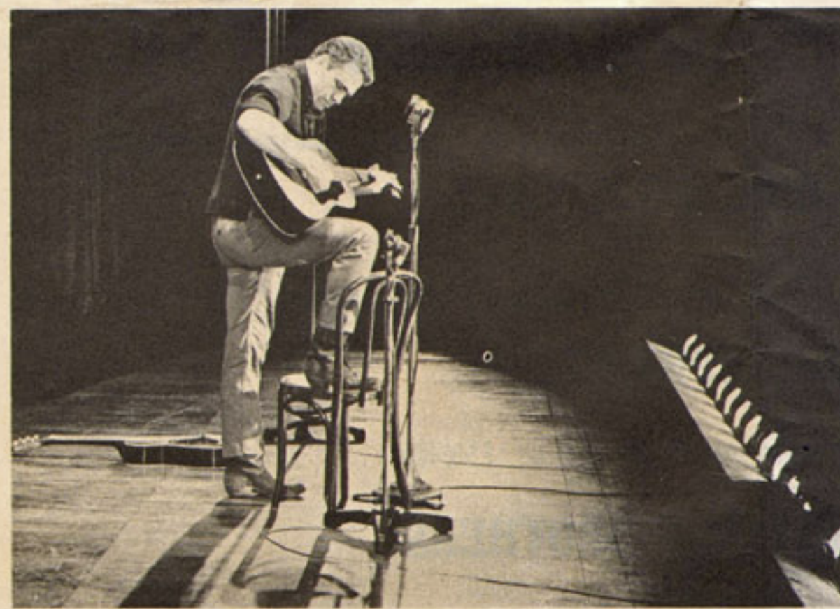
Hoyt Axton, well known to all folk fans, gave a performance that made everyone's spine tingle. They loved him! Every act on the show was so good no one could pick a favorite!