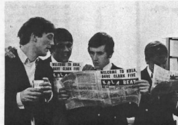
Before you could turn around, it was Dave Clark Five time, and the BEAT was there to cover the show for you (of course)! No wonder they think that lowest look at the headlines the show was fab!