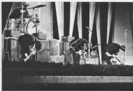
How many of you cried at that final bow? All too soon, the greatest group in the world left our town, but we really didn't feel too bad. After all, they said they would be back!