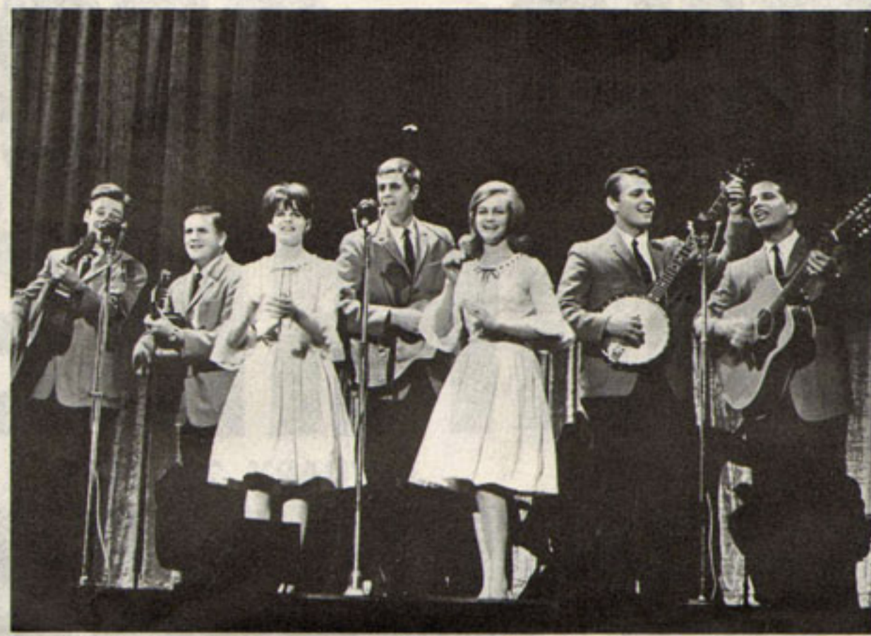
One of the newer groups on the folk scene is the Youngfolk, who give a lighthearted, happy glow to any audience. They'll go places! (and not only because they look so good!)