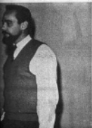
Meanwhile that just came over the speaker. And yes, that beard is still still for the camera, so we we'll catch her!