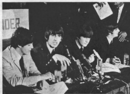
The press conference at the Classroom Club gave many of you a chance to see the boys close up. Of all the places they stayed at in this country, they liked K'R'L'A*M*D the best!