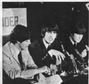
The press conference at the Cinnamon Club gave many of us the boys close up. Of all the places they stayed at, it had K'R'L'A'M'D the best!