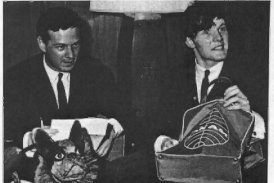
A few weeks later, Brian Epstein introduced Tommy Quickly to America! Of course, he picked L.A. for his first stop... wonder why? Could K&A have had anything to do with it? You bet! We're Brian's favorite!