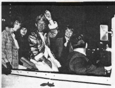
Guys who also was in the parade! The Emperor himself (in his gold Sells Royce, of course). With him were some very pretty models, who were overawed at being that close to the great emperor!