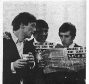
Before you could turn around, it was Dave Clark Five! There is more the show for you (of course)! Be sure to look at the headline! The show was fab!