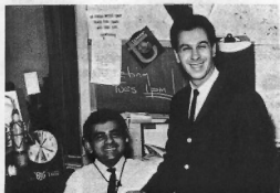
A few hours later, you all got a "backstage look" at KRLA. Record stars drop in all the time to say hello to their favorite station, and a day at KRLA is enough to make any fan happy!