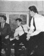
It was a work to discuss the programming and help to make K&A number one and