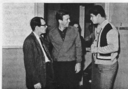
A few days later, the TAMM Show started filming. 2000 lucky KRLAers got free tickets to the show, courtesy of KRLA. And what a show it was! Every one you can think of was there in person!