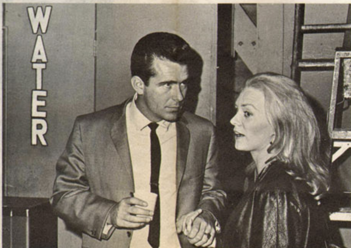
Bob Eubanks talks to the luckiest girl in America . . . Jackie DeShannon. Why lucky? She was the only girl to go on tour with the Beatles! And she told us that she loved every minute of it!