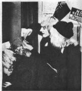
The boys decided to make some "adjustments" group is one of the funniest groups KRJA has. He was the greatest!