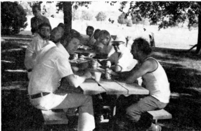
Refreshment time at tourney.

The annual golf-picnic outing for men from Earl May Seed and Nursery, May Broadcasting and Mt. Arbor Nurseries, which is called the "Emma" tourney, was held in June at the Legion-Country Club in Shenandoah. The staffers from KMTV, KFAB, Omaha, and KMA participate in another tourney following Emma. A complete report on the doings at these events is difficult to get but at last report, two pairs of glasses were broken and many pounds of beef were grilled to perfection. Some of the group are shown in that section of the club grounds set up for picnics, called the "grove."