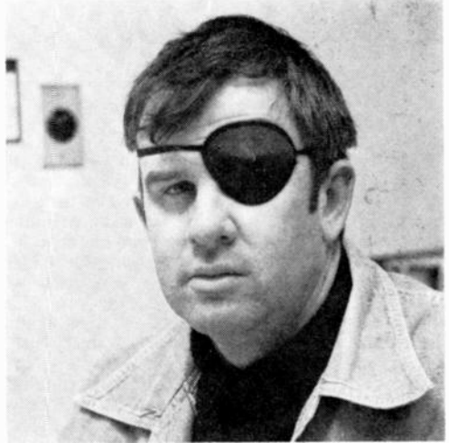
No more pirate jokes.