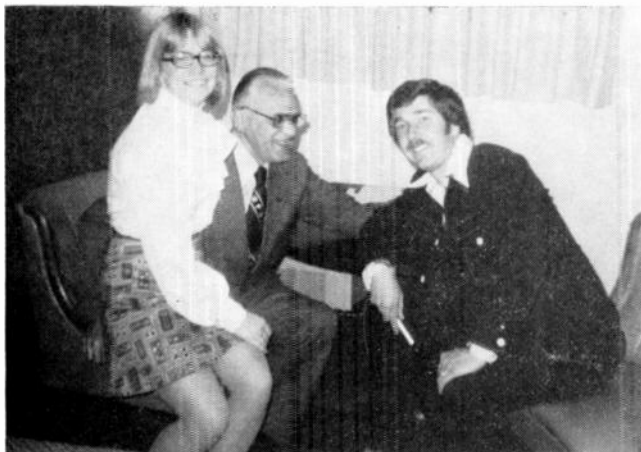
Proof for their grandchildren.