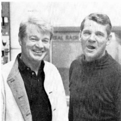
Can you top this?