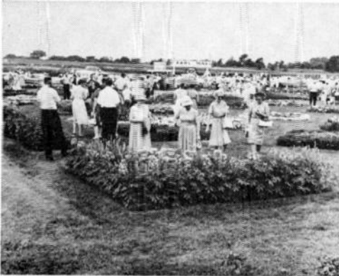
Center of interest . . . 52 sample border plantings. Plans made in mid-winter, planting in mid-May, full bloom in mid-July.