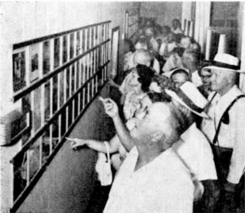
Visitors particularly enjoy looking over old-time pictures of KMA. Many recall visits in early days of the station. Crowds became too large to personalize tours. Guests browsed at-will, asked questions of staff on hand.