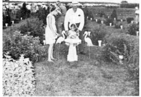
40 evergreen samples — 50 shrubs. Youngster is attracted to big birds "with no feet."