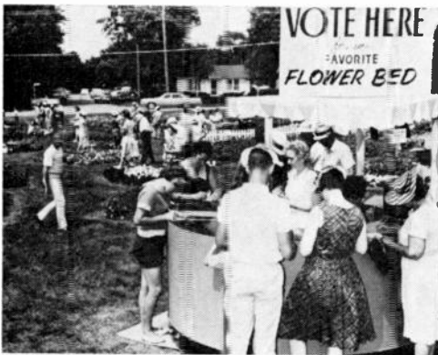
Vote for your favorite border planting. If you picked bed No. 5, you were in the majority. A duplicate supply of seed goes to all who selected the winner (see p. 4).