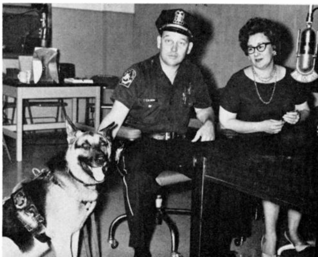
A real police dog. Man's best friend . . . if you're a "good guy."

Wouldn't it be fine and dandy, If each hand-clasp warm and true Carried with it this assurance; "I know something good about you." Wouldn't things here be more pleasant If the good that's in us all Were the only thing about us That folks bothered to recall! Wouldn't life be lots more happy If we'd praise the good we see, For there's such a lot of goodness In the worst of you and me! Wouldn't it be nice to practice This fine way of thinking, too — "You know something good about me, I know something good about you."