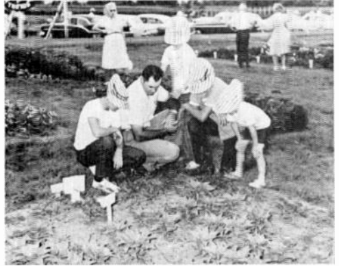
Sign says: "touch me." Father and sons touch Sensitive Plant ( Mimosa Pudica ). Leaves fold up when touched.