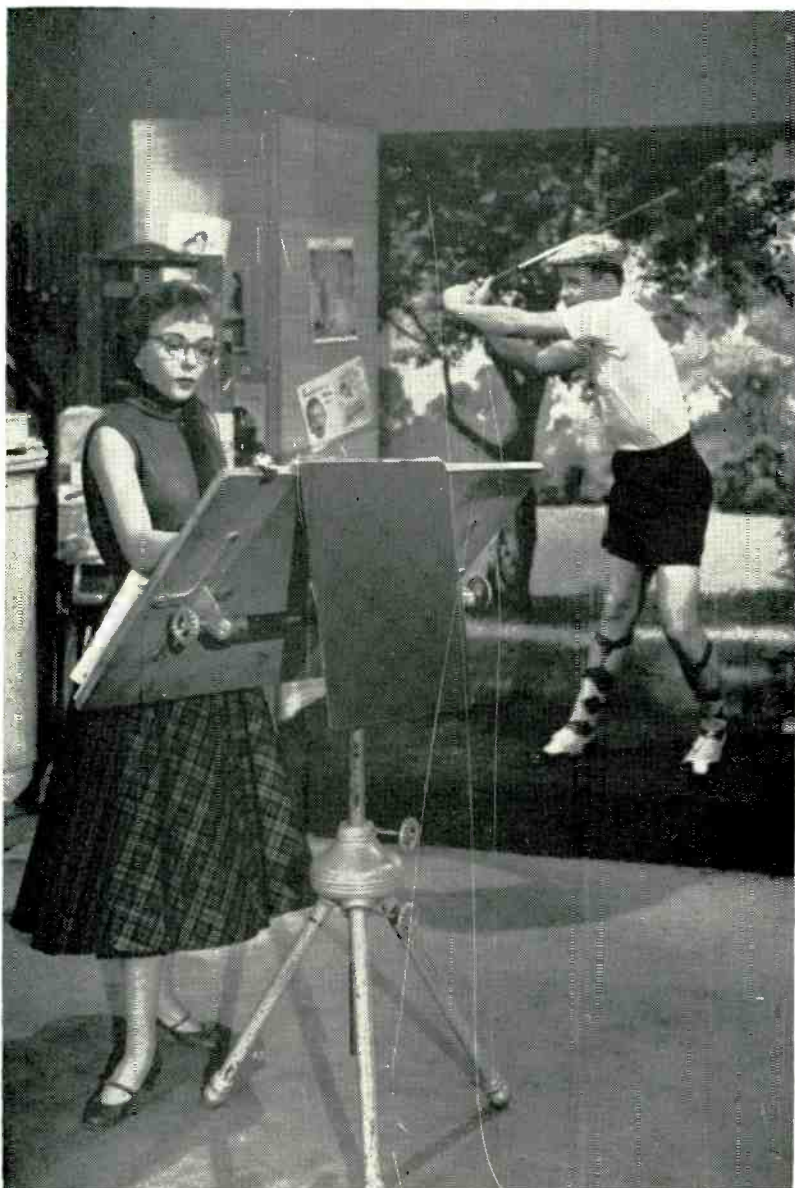
IDA LUPINO portrays a commercial photographer and Jack Lemmon plays a client who poses as a photographer's model in "Marriageable Male," a Ford Theatre comedy which will be presented on KFJR-tv in March.