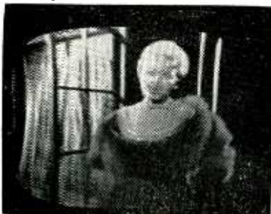
Jo Stafford—in and out of focus