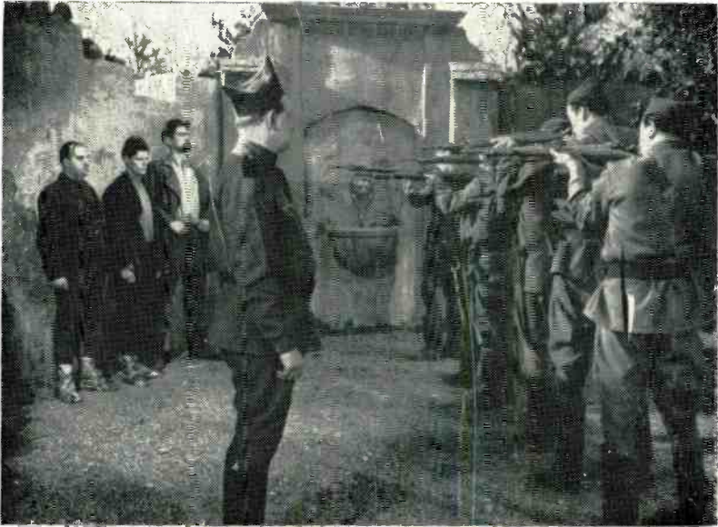
THREE POLITICAL PRISONERS —Three prisoners face the firing squad in the dramatic story, "Death of Michael Turbin," a story to be seen by KFYP-tv viewers on the "Douglas Fairbanks Presents" show.