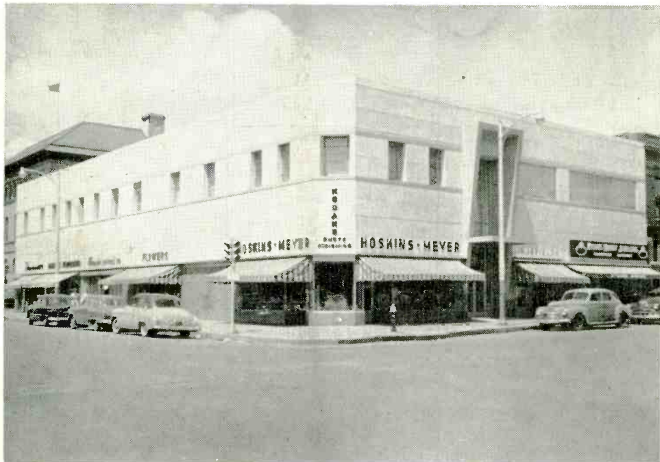
Radio Center Building in Bismarck; home of KFJR

Sec. 34.66 P.L.&R. U. S. POSTAGE 1c PAID Bismarck, N. D. Permit No. 150