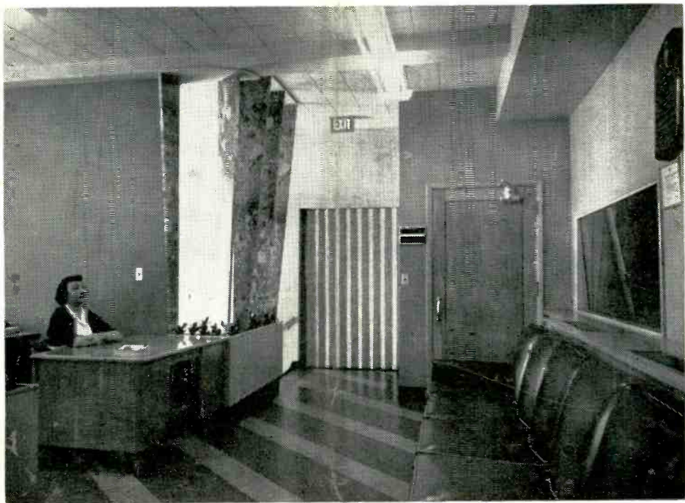
Bette Severson at work at the reception desk in the KFYP Radio Center lobby. Door at right leads to Auditorium Studio. (Windows at right look into Auditorium from the rear.) Visitors are always welcome at Radio Center and regular tours are conducted daily.