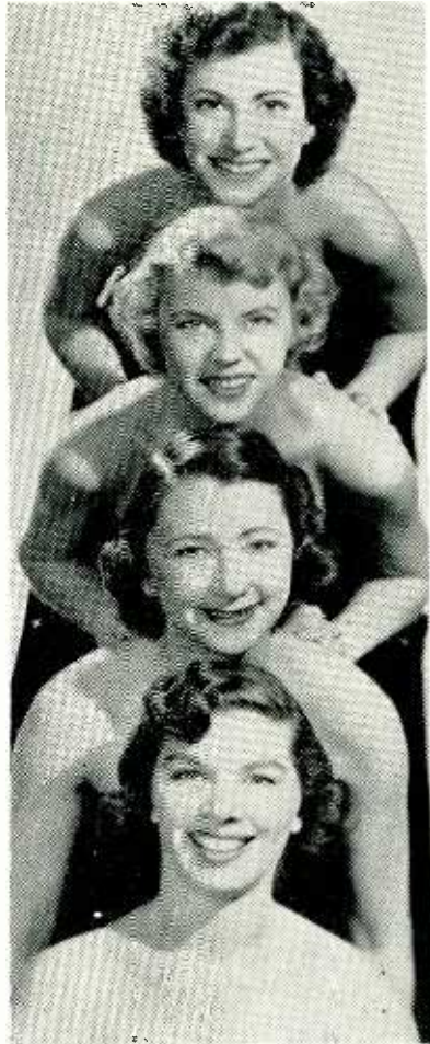
The Moon Maids

In the meantime RCA Victor signed the band to a recording contract. But it was not until January 1945 that the first really big break came along, when they recorded "There, I've Said It Again." It was made merely to fill space on the second side of a record featuring the