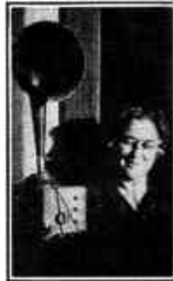
Many Listeners still use "Loud Speakers" and Headphones

the heart-melting Christmas message by King George V, followed so soon by the Empire in mourning. The Royal Visit of 1939 was an epoch, and an epic! And the CBC can never, never be given credit enough for their interpretation, their contribution to national appreciation of that visit. Without that the millions who, like myself, could not see Their Majesties, would not have felt the magic touch of their visit. With that we shared the thrill of millions of individuals.